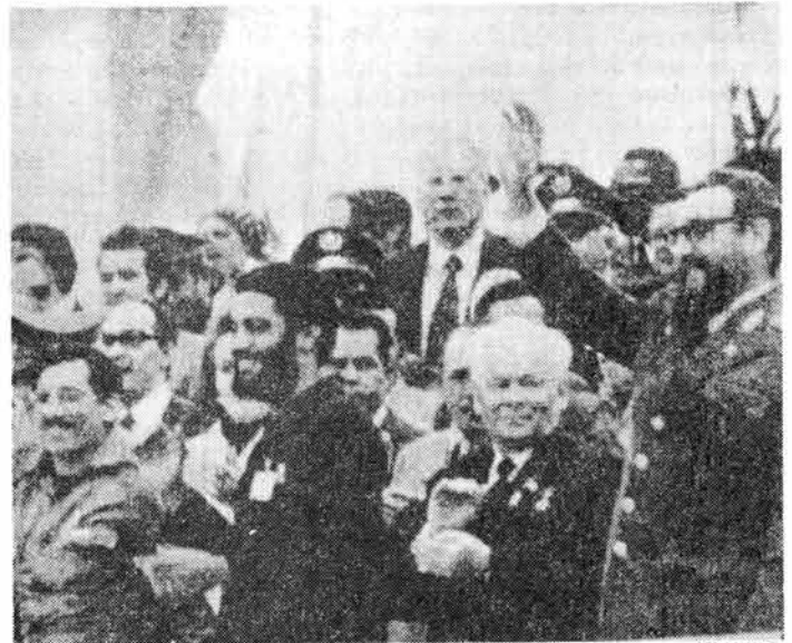
Granma December 20 mass rally in Havana. From left: Humberto Ortega of Nicaragua; Maurice Bishop of Grenada; Konstantin Chernenko of the Soviet Union; and Cuban president Fidel Castro.

One thing, though, we wouldn't be using spears or arrows. We'd have a rifle, a grenade or a mine in our hands. (APPLAUSE) Maybe a tank, a cannon or a bazooka, or an anti-aircraft gun,