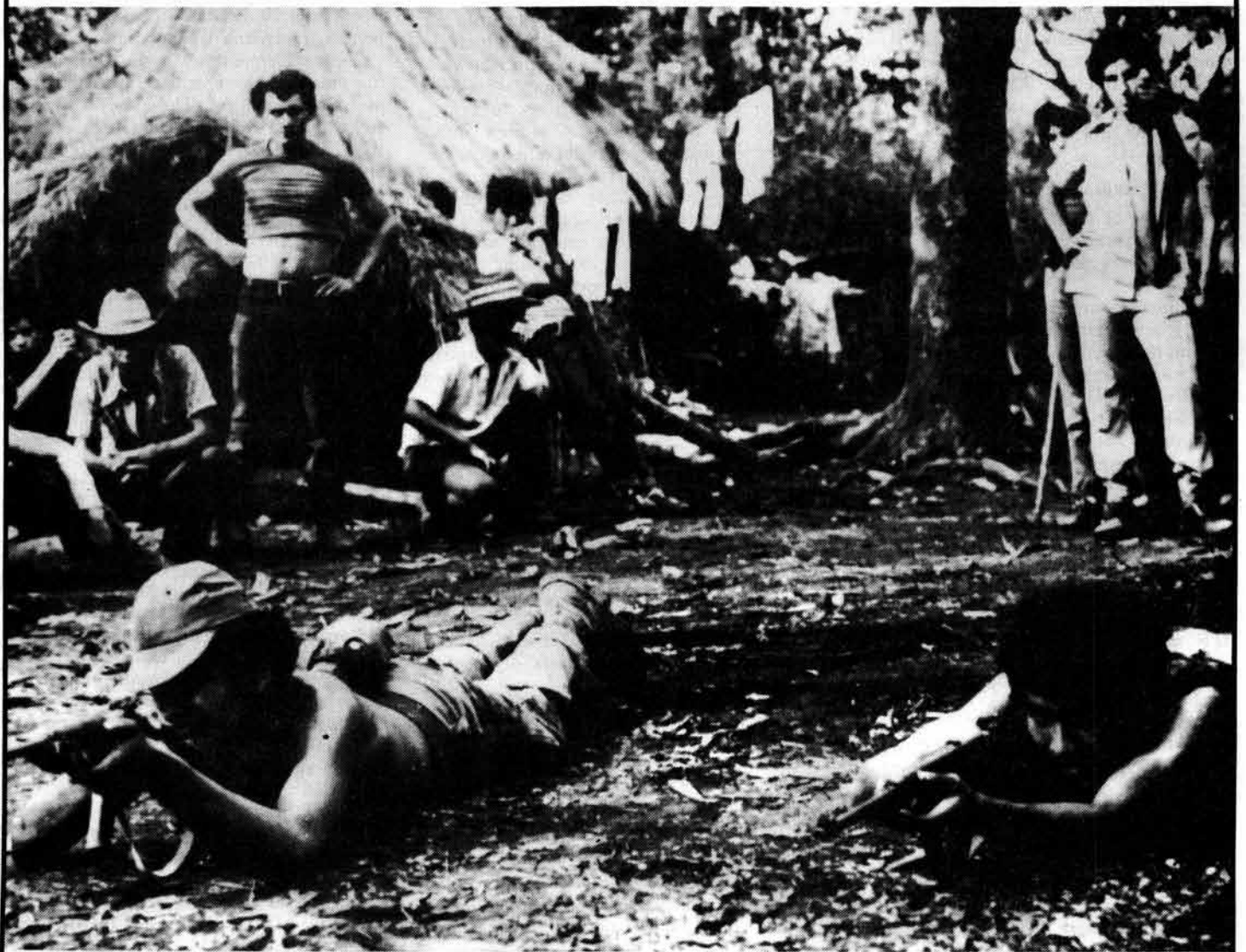
Salvadoran freedom fighters undergoing training at rural camp in July.