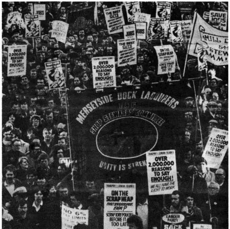
150,000 people demonstrated November 29 against policies of Tory government and massive rise in unemployment.

That shift to the left inside the Labour Party was interrupted in 1973-74. The Labour government that was elected in February 1974 came to office and made considerable concessions to the working class in its first year. But then the right wing inside the party went on the offensive and rolled back the gains of that October conference. In the June 1975 referendum that was held on British membership in the Common Market, the party was split down the middle. The left wing's response to this was extremely feeble. Benn, who led the opposition inside the Labour Party to Common Market membership, was soundly defeated inside the party at