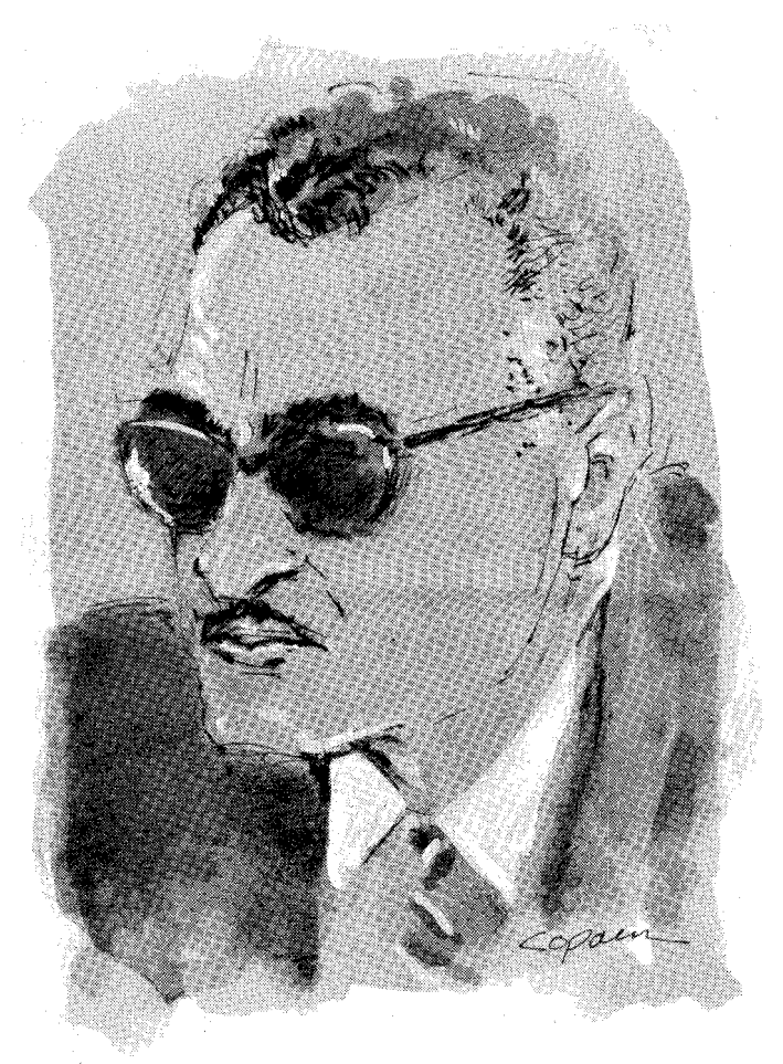
GAMAL ABDEL NASSER

The <u>New York Times</u> is keenly aware of this and has been drawing some lessons about it for the edification of those entrusted with the destiny of U.S. imperialism. These make very interesting reading.