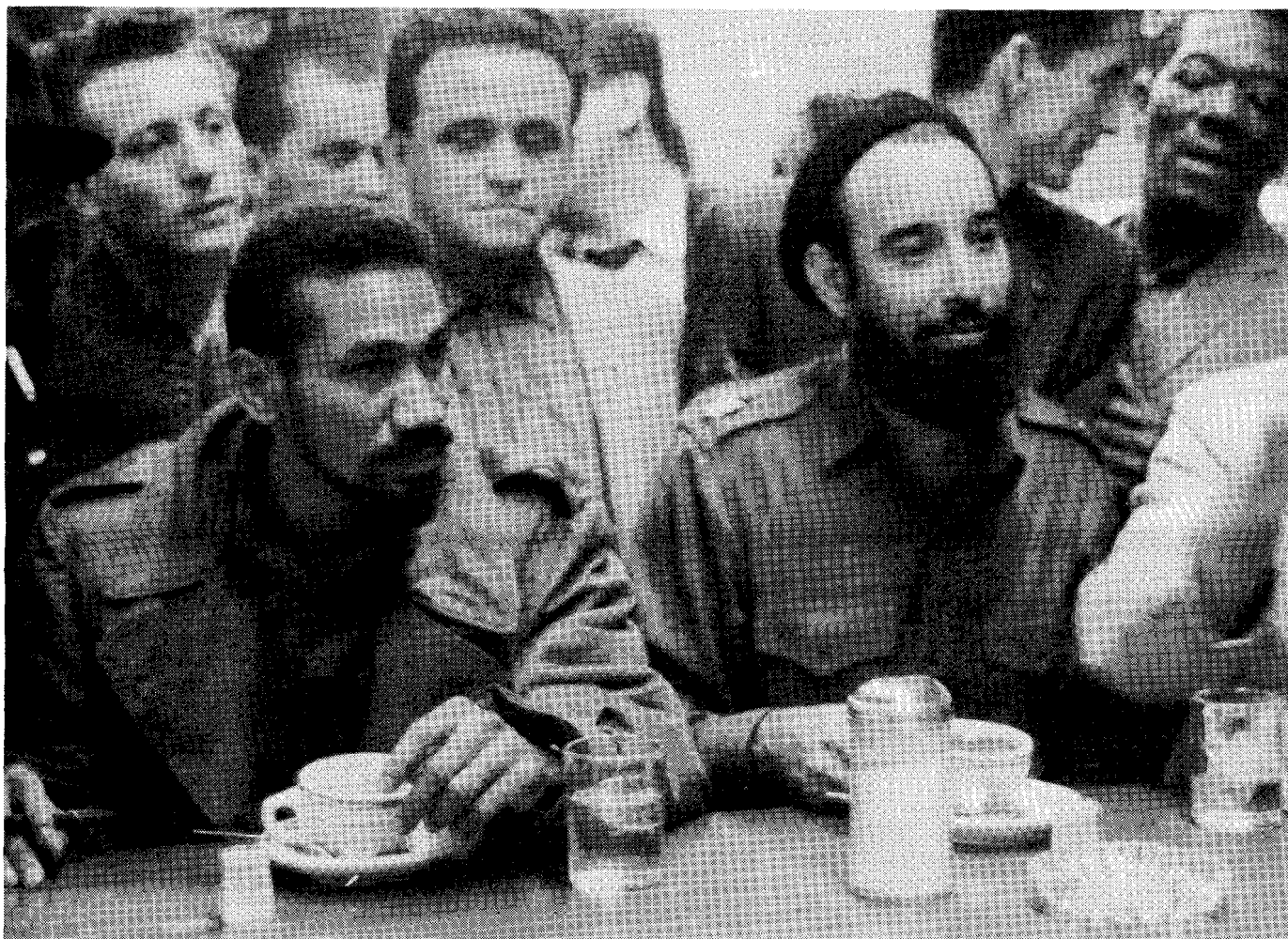
JUAN ALMEIDA BOSQUE (seated left) and Antonio Núñez Jiménez (seated right) enjoying a cup of coffee in a Harlem cafe in September 1960. They were part of a delegation that accompanied Fidel Castro to New York when the Cuban leader addressed the United Nations on the problem of American imperialism and its belligerent policies. The people in Harlem turned out in huge crowds, surrounding the Hotel Teresa where the revolutionists stayed and giving them a welcome that is still remembered in the New York ghetto.

Many have been led to believe that the workers can produce more and better only by means of the direct increase of their salaries or their individual economic incentive. This is true in a capitalist society, since the workers are not the owners of the means of production. They do not own the factories, the land or the country's wealth. They work only to subsist, to survive, without faith or hope in the future. And this is a logical thing under a system of exploitation where work is not dignified and can never be dignified.