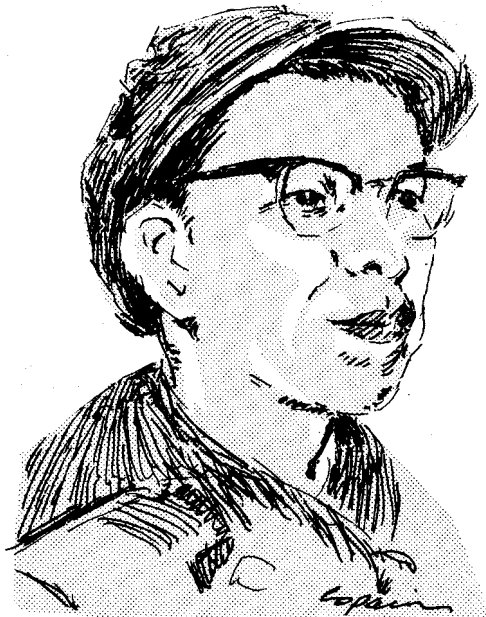
MRS. CHIANG CHING

In a parallel move, reported in Tokyo on the basis of all posters that appeared in Peking February 13, Mrs. Chiang Ching, the wife of Mao Tse-tung, was placed in charge of a Committee of Orientation for the Cultural Revolution. The job of this committee, apparently, is to screen the central bodies of the party and the government for possible deviationists. Its connection with the Committee of the Cultural Revolution headed by Chen Po-ta, which was functioning under the control of the party's Central Committee remains unclarified.