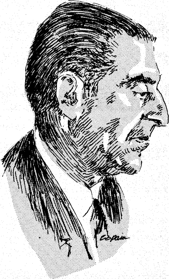
EDUARDO FREI MONTALVA

As noted at various times in World Outlook during the past year, the Cuban government has made some very cogent criticisms of the Frei regime in Chile, which is currently serving as a display case for the State Department in Latin America. The attitude of the Cuban government toward Frei was one of the main indicators in determining how false was the judgment offered by certain ultraleftists that the Tricontinental Conference in January 1966 marked a "turn to the right" for Castro.