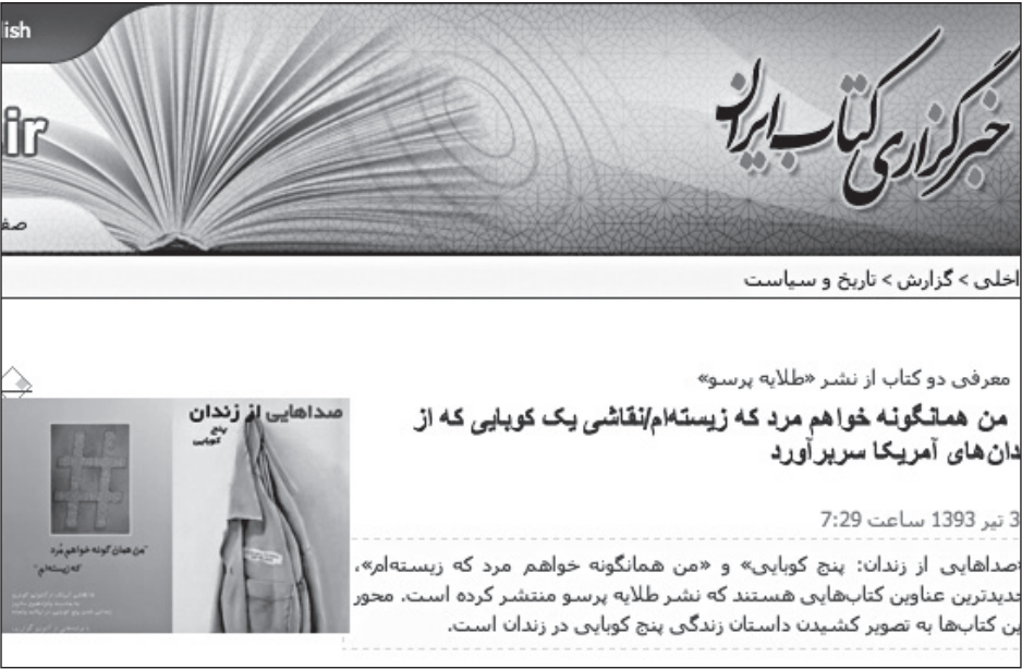
Semi-official Iran Book News Agency posted on its website July 22 reviews of I Will Die the Way I've Lived and Voices From Prison: The Cuban Five , both recently published in Farsi.