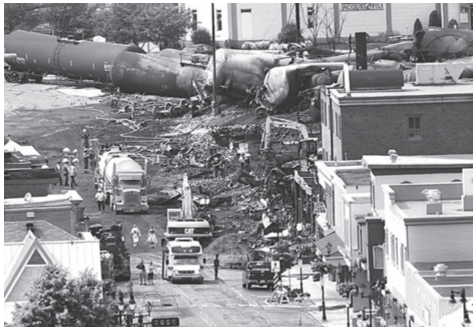
Bosses' profit drive superseded safety of rail workers and those who live near tracks, leading to July 6, 2013, oil-train derailment that killed 47 people in town of Lac-Mégantic, Quebec.

Donations for the defense of Harding and Labrie can be made at www.justice4USWrailworkers.org .