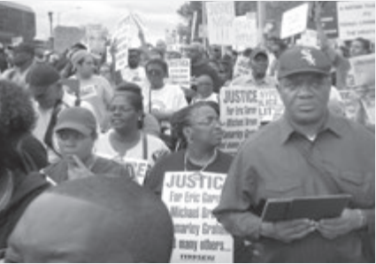
Thousands rally Aug. 23 in Staten Island, N.Y., against cop killing of Eric Garner.

The capitalist rulers organize police forces to protect their interests and keep working people “in their place.” From Ferguson, Missouri; to Staten Island, New York; to Chicago and the U.K.; the ‘Militant’ covers fights against cop brutality, killings and frame-ups.