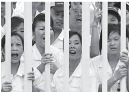
Under capitalism workers are “dehumanized and degraded to the status of things” and forced to compete for jobs. As they resist bosses’ attacks and build a revolutionary movement to fight for power, they strike at the source of alienation. Above, workers in Honda plant in China. Inset, Chinese Honda workers strike in 2010.