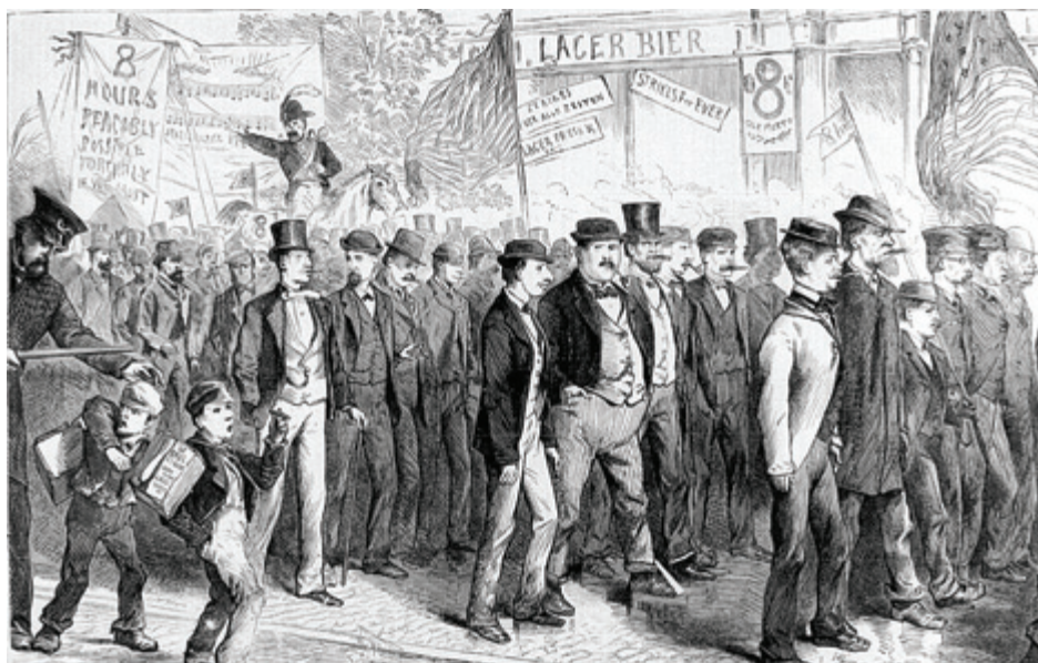
Frank Leslie’s Illustrated Newspaper

Illustration of labor demonstration for eight-hour day in New York, September 1871. Banner to the left says “8 hours peaceably if possible—forcibly if we must.”