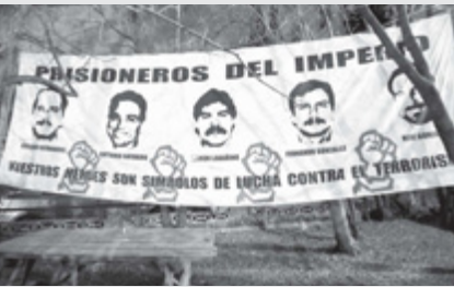
Banner for Cuban Five outside home of sculptor Armand Vaillancourt in Montreal says “Prisoners of the empire.”

Read about the Cuban Five, Cuban revolutionaries held in U.S. jails for nearly 12 years on frame-up charges because they were gathering information on right-wing groups in Florida with a history of violently attacking Cuba.