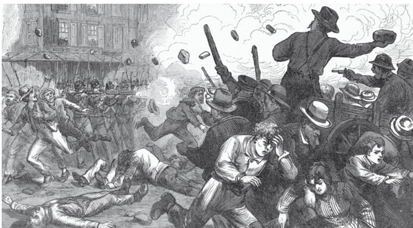
Rail workers in Baltimore battle police during 1877 strike. Marx called it “first eruption since Civil War against associated oligarchy of capital.”

The banner “Life, Liberty and Property” was much more in the interests of all working people. It was the dispossession of independent toiling producers by capital that left us with no other choice but to sell our labor power to an employer in order to survive and thus gave rise to our class, the hereditary proletariat.