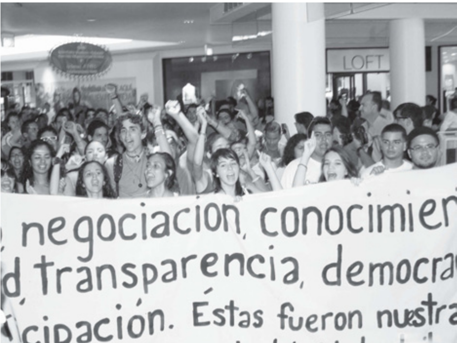
Students from University of Puerto Rico march through Plaza Las Américas shopping center in San Juan May 22 to win support for strike that began April 21.

Students and labor unions have called for a march to the governor’s mansion May 27 to support the strike.