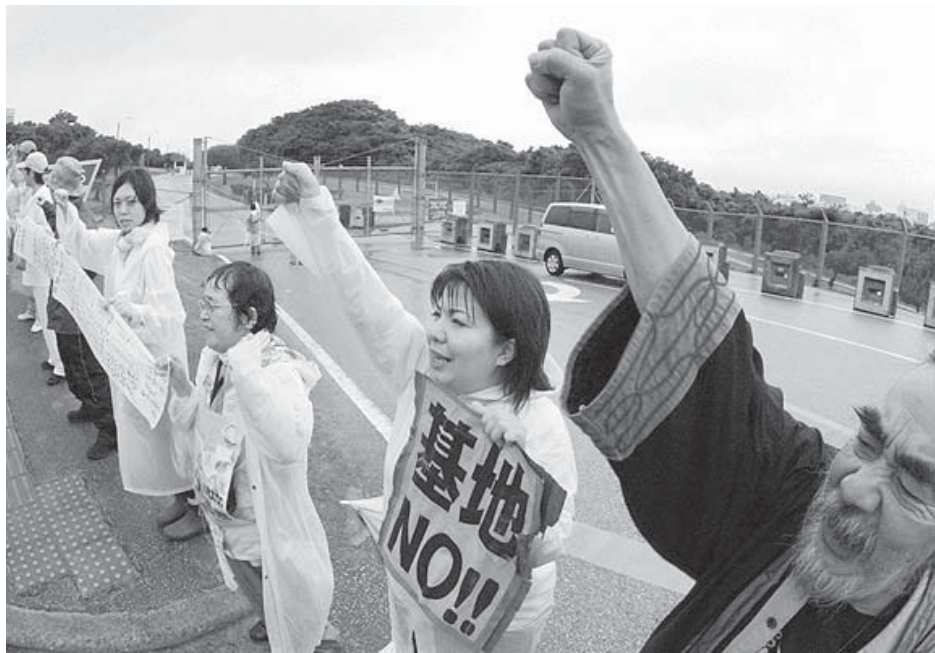
May 16 human chain of 17,000 surrounded U.S. Futenma military base on Okinawa, protesting Japanese president's decision to allow Washington to keep troops on island.

Former Okinawa governor Keiichi Inamine said that if the Japanese government keeps the base on Okinawa, "You might see people's anger begin blowing up like pent-up magma erupts from a volcano."