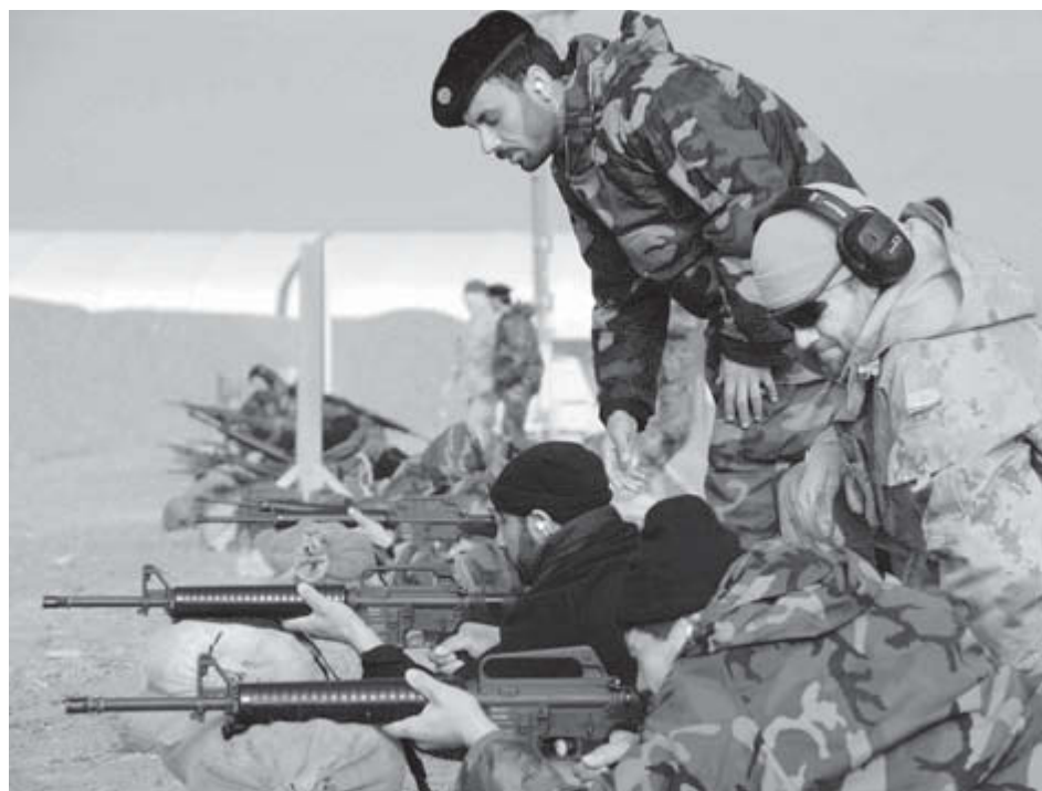
Canadian Department of National Defence

London spent £25 billion (1£=US$2) on the bailout. With the nationalization,