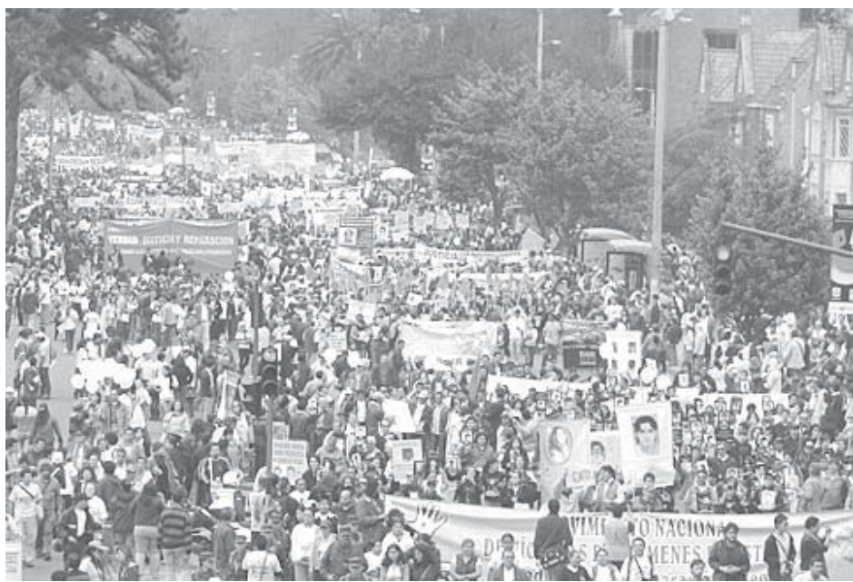
Some 40,000 people march in Bogotá, Colombia, March 6 against war moves against Ecuador by the Alvaro Uribe administration and government support for paramilitary death squads.

Since the election of Hugo Chávez to the presidency in Venezuela, Washington has stepped up its military aid to neighboring Colombia. The U.S. government has given more than $5 billion to Colombia's army and police since the William Clinton administra-