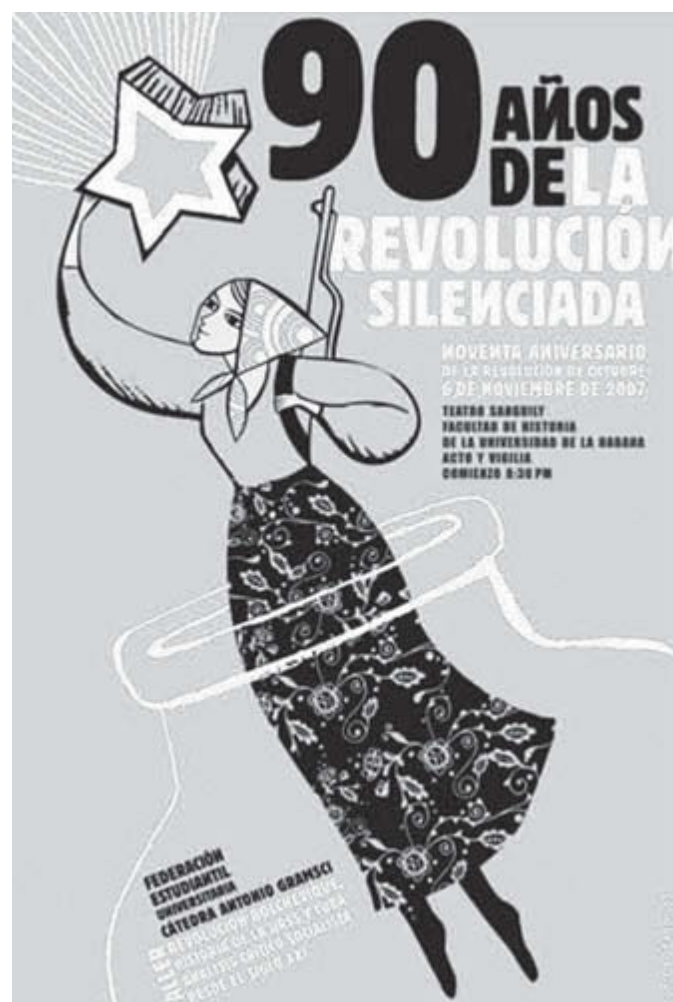
Poster advertising November 6 rally in Havana on the 90th anniversary of the Russian Revolution, sponsored by Cuba's Federation of University Students. The event was part of an ongoing campaign by the FEU to organize youth into activities discussing revolutionary struggles around the world and their lessons for today.

Following these speeches, the assembled students marched to the plaza in the middle of the University of Havana campus and waited until midnight. Then they celebrated the