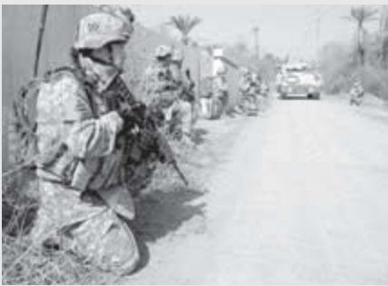
U.S. soldiers prepare “clearing operation” with local militia February 16 in villages southeast of Baghdad, Iraq.