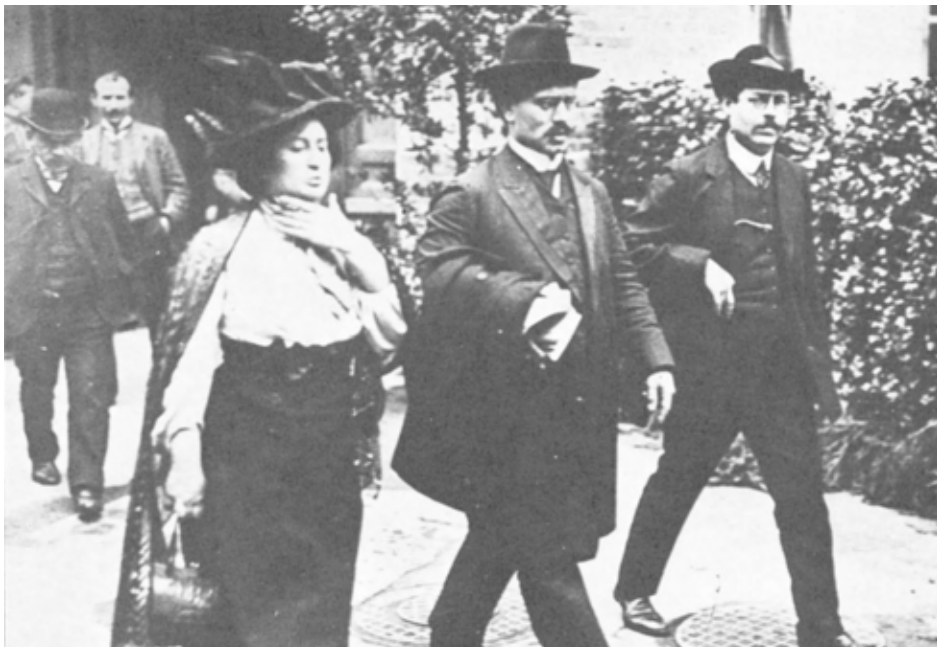
Rosa Luxemburg and Karl Liebknecht (center) attending the German Social Democratic Party congress held in Leipzig, Germany, in 1909.

At first view the title of this work may be found surprising. Can the social democracy be against reforms? Can we counterpose the social revolution, the transformation of the existing order, our final goal, to social reforms? Certainly not. The daily struggle for reforms, for the amelioration of the condition of the workers within the framework of the existing social order, and for democratic institutions, offers to the social