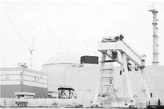
Above: Iran’s Bushehr nuclear power plant. Russian government has come under fire from Washington for its assistance in construction of the plant. Right: International Atomic Energy Agency director general Mohamed ElBaradei, who has fronted campaign to force concessions from Tehran.

“Almost two years after the IAEA became aware of Iran’s covert nuclear program,” he claimed, “delayed access, inconsistent stories and unanswered questions continue to be the hallmark of Iranian