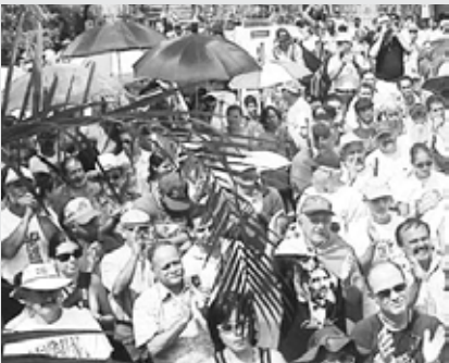
Grito de Lares celebration, September 2002

The fight for Puerto Rico’s independence is of vital importance to working people in the U.S. A successful struggle to end colonial rule will deal blows to the common oppressors of toilers in both countries. The ‘Militant’ brings you the news of this national liberation struggle. Don’t miss a single issue!