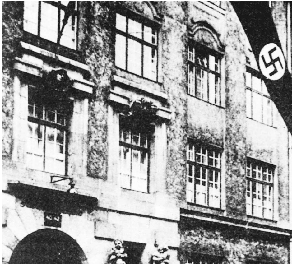
Nazi swastika flies over trade union headquarters occupied by fascist storm-troopers in Munich, Germany, in 1933.

This action is directed first and essentially against the working class . The fascist state begins by creating conditions that will