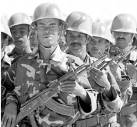
Polisario soldiers during celebrations of 25th anniversary of independence movement, February 2001.