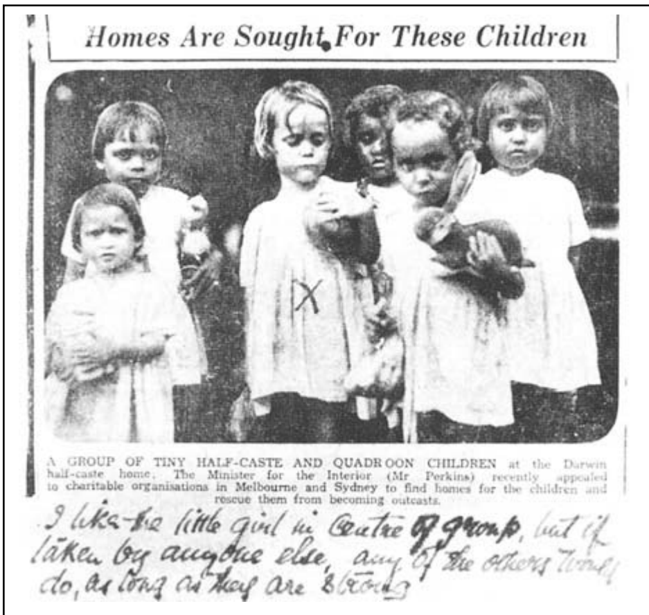
Photo of “half-caste” Aborigine girls includes comments by prospective adopter

The national struggles by the Aboriginal people over the decades have helped to lift the lid on the impact of government policies.