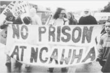
July 2002: Maori in Kaikohe protest against construction of prison on traditional lands.

Over the last four decades, Maori in New Zealand have said ‘enough!’ to the capitalists’ denial of their national rights. The ‘Militant’ covers this fight and reports struggles by other oppressed nationalities, including the Aborigines in Australia and Blacks and Native Americans in the U.S. Don’t miss a single issue!