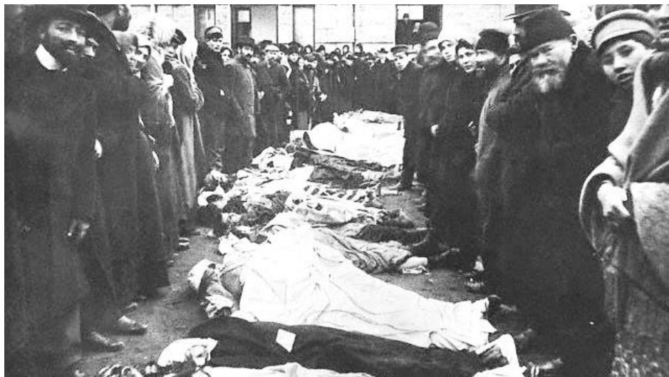
Victims of anti-Jewish pogrom, or massacre, in Russia circa 1905.

He who attentively observes Soviet life, even if only through official publications, will from time to time see bared in various