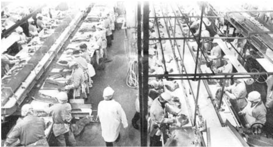
Meat packers at Smithfield plant in Tar Heel where there is a union organizing effort

The 975,000 square-foot plant located in Bladen County, North Carolina, employs 6,000 men and women, 60 percent of whom are Latino. Most other workers are