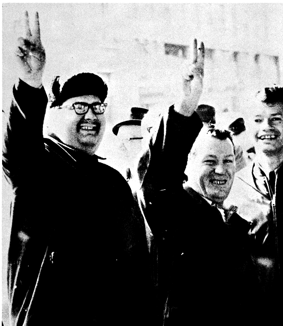
Militancy and solidarity throughout

The corollary to this is that union power and strike power, used in the limited and restricted manner imposed by the capitalist-minded union bureaucracy, prove the need of a deeper political awareness. Such awareness grows in the course of these strikes. The use of the strike weapon is one of the ways deeper political class consciousness develops among the ranks of the workers. The confrontation and testing of class strength is the means by which a tran-