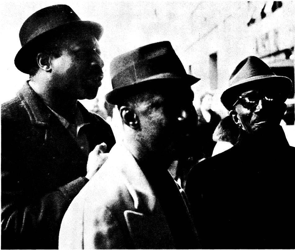
Strikers at New York Post Office