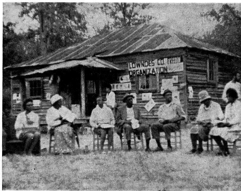
BLACK PANTHER PARTY. Headquarters of independent black party in Alabama.

"Here the chief weapon of the ghetto dweller is the vote. Insofar as it is used to elect officials within the ghetto who are genuinely representative of the masses, the vote obviously has importance. But as a means of putting pressure on city, state and federal governments, it is practically valueless. If the ghetto sends its own representatives to outside governmental bodies, they are in a hope-