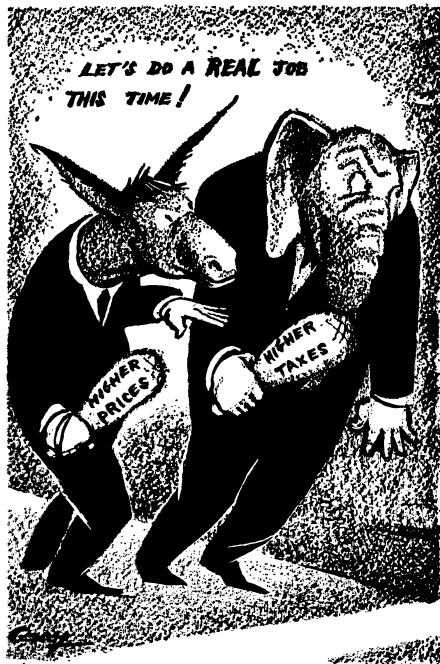
BIPARTISAN PROGRAM. Devaluation of British pound is being used as excuse by Democrats and Republicans to push for tax hike — but prices are going to continue to rise in any case.

First of all, it demonstrated how tightly interconnected the system is on an international scale. What happens in one capitalist center affects all the other capitalist centers — and drastically and immediately. Even the cushion of a time lag of a few months or weeks is gone. We have reached the epoch of built-in international crises that can be fired off instantly.