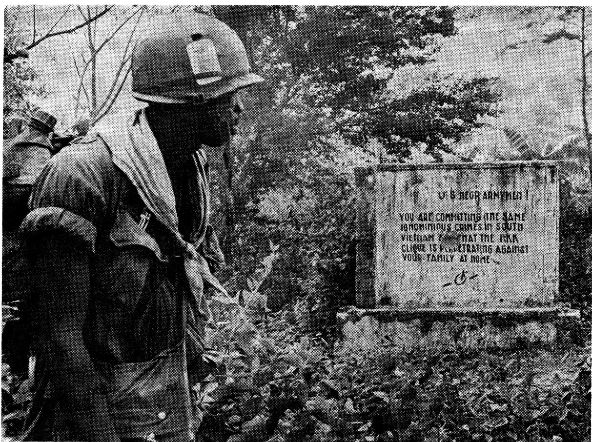
COMMUNICATION. Black U.S. soldier reads message from National Liberation Front. Message says, "U.S. Negro Armymen! You are committing the same ignominious crimes in South Vietnam that the KKK clique is perpetrating against your family at home."