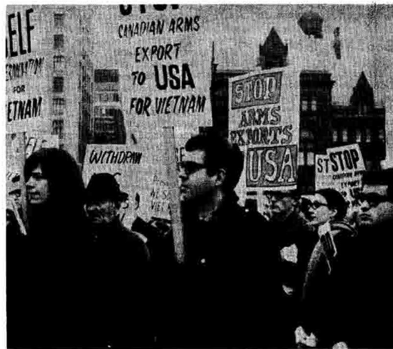
AGAINST WAR IN VIETNAM. Toronto demonstration demands an end to Canadian complicity in Vietnam war.

In Ottawa, the Carlton University committee held a demonstration at the national war memorial on Nov. 11, and then attempted to march to the parliament building. They were stopped by 100 cops of