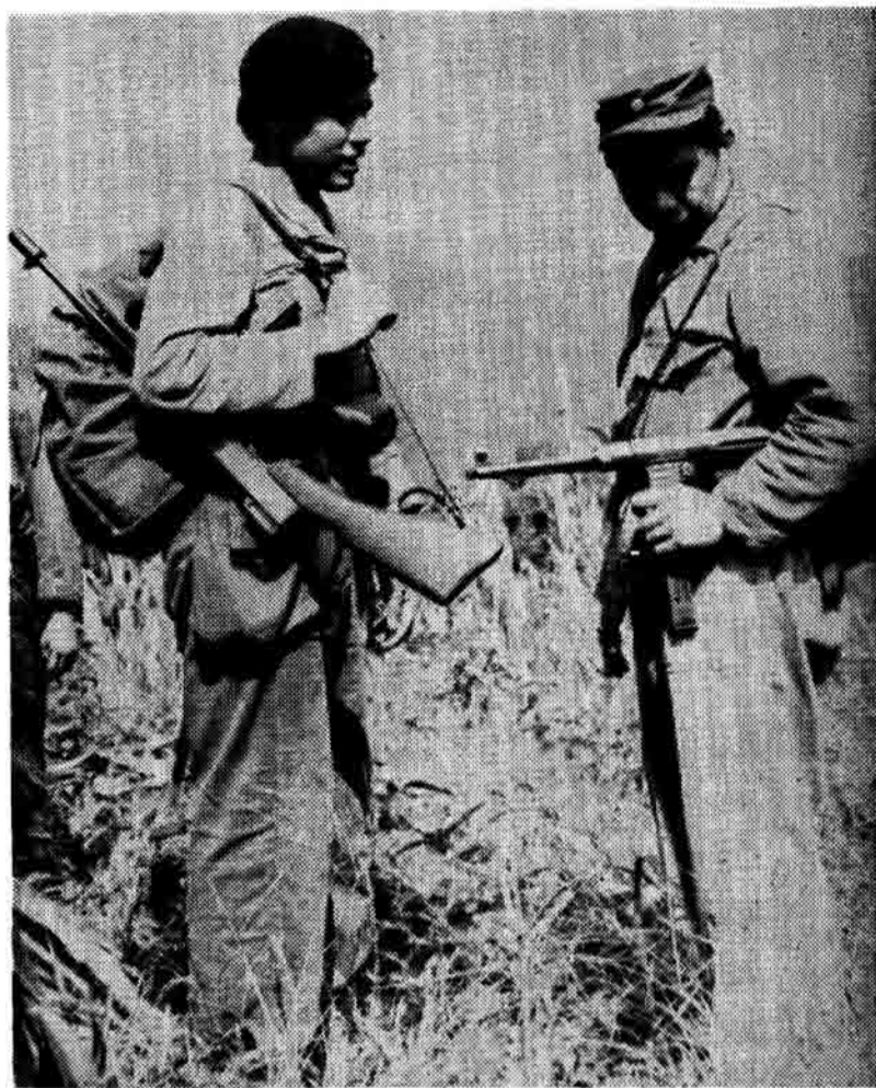
GUERRILLA FIGHTER. MR-13 leader Marco Antonio Yon Sosa (right) heads one of Guatemalan guerrilla groups.

"This kind of justice is usually reserved for bad men — military