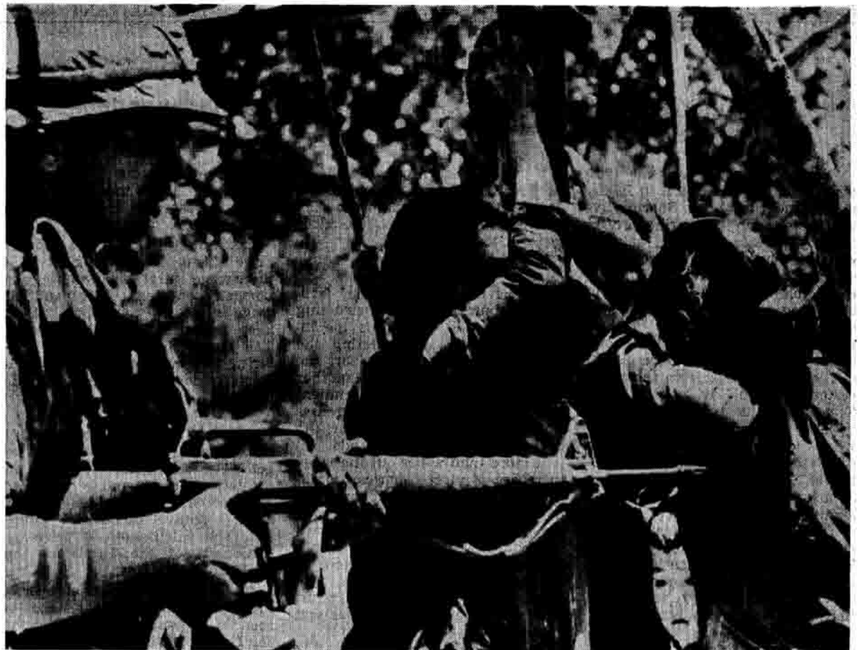
U.S. GUN HELD ON CIVILIANS. Women and child placed against post by U.S. soldier during attack on south Vietnamese villagers.

He called on the Negro people to unite and take care of each other. The killing of a single Negro (Continued on Page 2)