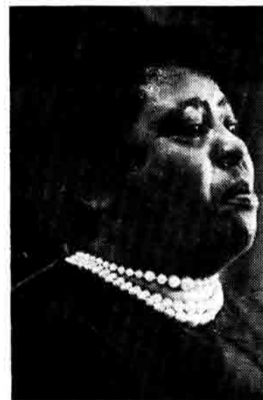
Fannie Lou Hamer