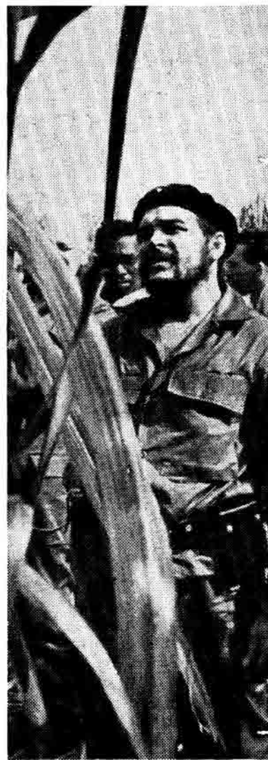
GUEVARA AND MIKOYAN. (Deputy Premier Anastas Mikoyan machine during Mikoyan's Nov spent three weeks there in unsuccessful to accept proposal for UN inspection missile crisis of that time.)

One can say, in concluding this subject, that the struggle in Latin America develops in the sense of a struggle by all means against the neo-colonialist power that exists in general in these countries and that this struggle breaks out in many cases in an armed struggle of the people, a struggle that is very hard, which must be de-