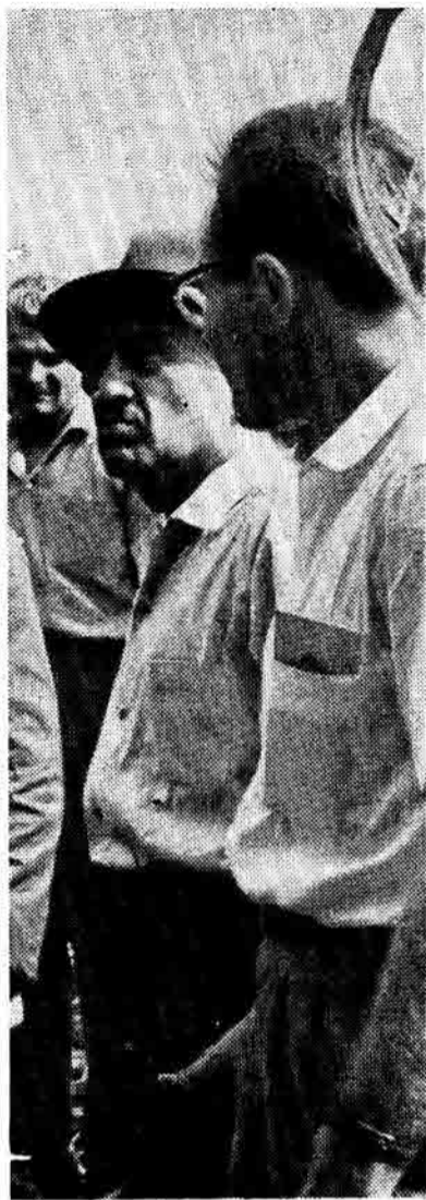
Guevara, in beret, and Soviet officer in fedora, inspect cane cutting crew 1962 visit to Cuba. Mikoyan's successful effort to persuade Cubans on of island as means of ending