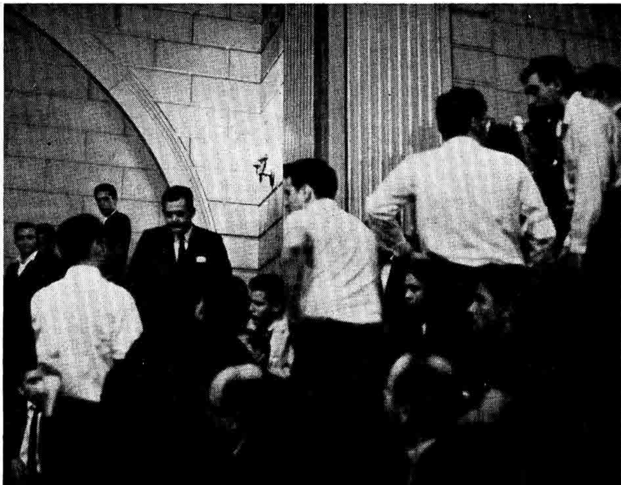
OUT THEY WENT. Young men in white shirts convince Cuban counter-revolutionaries at New York Town Hall meeting that it would be wise for them to leave and not try to disrupt meeting.