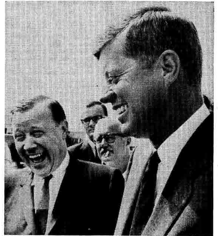
HEE-HAW! UAW President Walter Reuther almost busts a gusset laughing at Kennedy quip. Panel of veteran unionists noted growing dependency of union brass on government as important source of sapping of union strength.

American foreign policy has made Yankee imperialism a hated symbol of oppression throughout the world. In the name of rabid "anti-communism," Washington has propped up and perpetuated the rule of the most loathsome puppet dictators that ever disgraced the human race. Billions of American dollars are expended