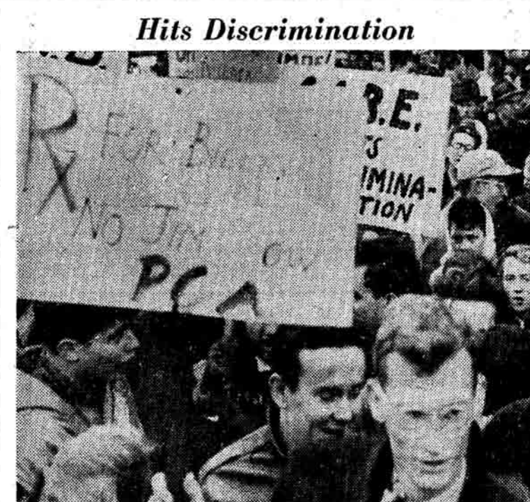
Chanting slogans and bearing signs, more than 1,000 University of Chicago students took a "recess" from classes and held a campus rally to protest against racial discrimination in the college hospital and medical school.

Furthermore, even if there is a third party presidential slate, Wallace stated in Syracuse, "I do hope