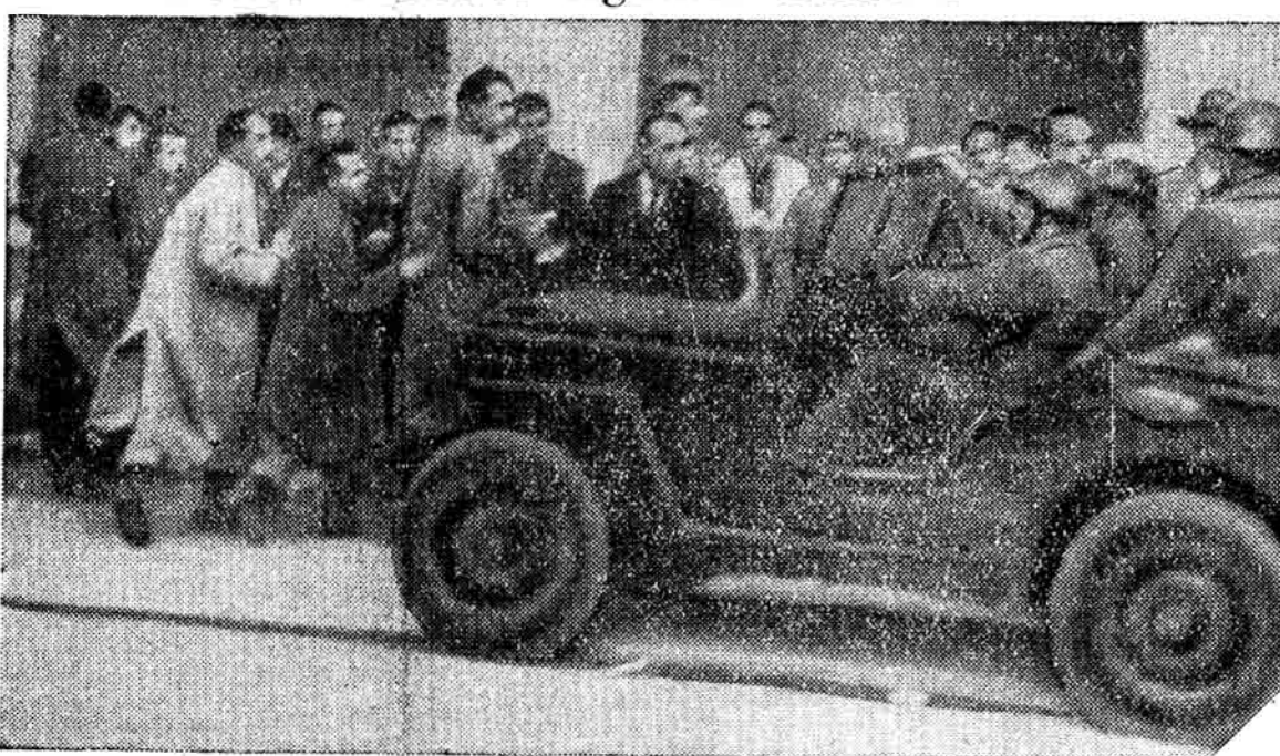
Driving over the curb, these Rome cops charged their American-made jeep at hundreds of strikers as the Italian government mobilized to break the general strike. After two days the Stalinist union heads called off the strike, claiming a "victory." See story on page 2.