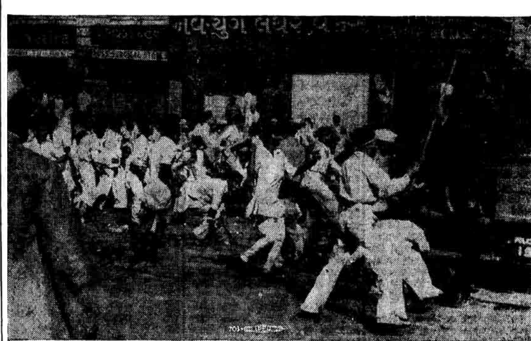
Scenes like this, showing brutal assault on workers demonstrating for independence in Bombay on January 24, 1946—have been common throughout India since the end of the war. The resurgence of the masses who are fighting courageously for freedom, is the background for the current negotiations between British imperialism and the Indian capitalist class.

ent Assembly for a fake transfer of power. It is a carefully designed instrument for negotiating the permanent framework of a long-term imperialist-bourgeois-feudalist alliance.