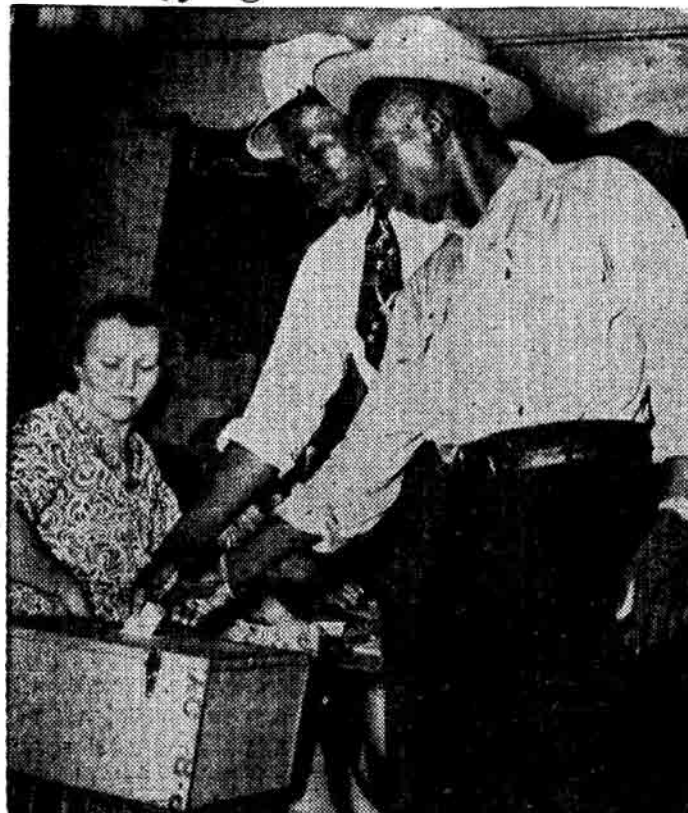
Here are two of the estimated 5,000 Negroes in Mississippi who were permitted to register and who defied Democratic Senator Bilbo's threats of lynch violence by voting in last week's primaries. Hundreds of thousands of white and Negro workers are still denied the ballot through poll tax and other restrictions.