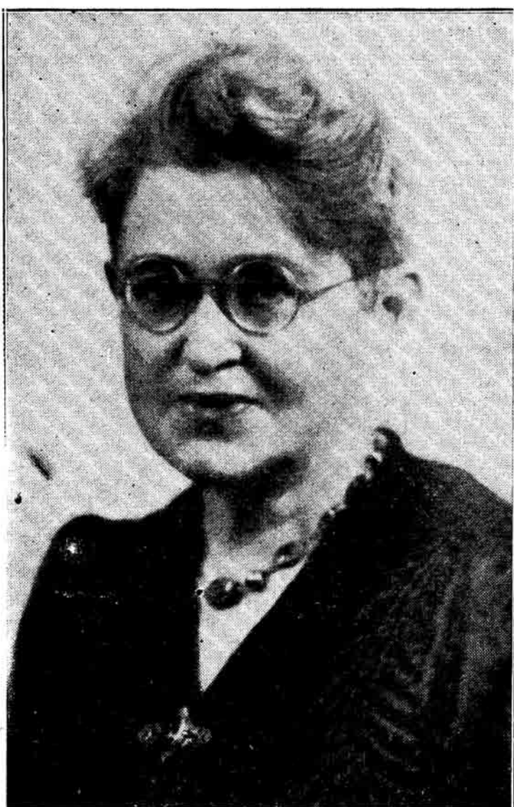
ANTOINETTE KONIKOW 1869—1946