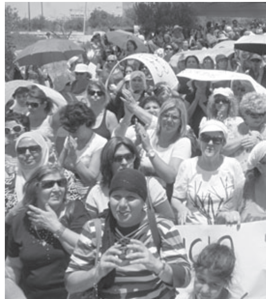
July 2010, contract workers at day care centers, w same conditions as permanent employees. Socialist Palestine is through common revolutionary struggle