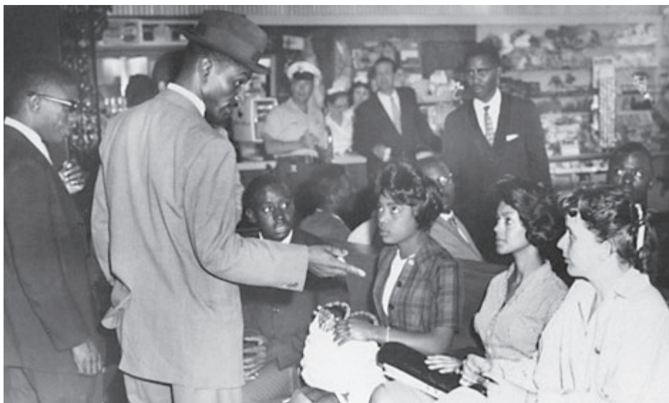
SWP acts on fact of disproportionate weight, in numbers and combativity, of workers who are African-American in vanguard of social and political battles. Fred Shuttlesworth (pointing), leader in movement for Black rights that smashed Jim Crow, talks with Freedom Riders released from jail in Alabama in "whites only" section of Birmingham bus station, May 17, 1961.

That's the opposite of the class-divided character of education under capitalism, where schools for the ruling families and better-off middle layers prepare them to maintain their privileges. But for the big working-class majority, Barnes said, our lives are a cycle divided into being a child, the time we "learn" (above all to be obedient to a boss); then