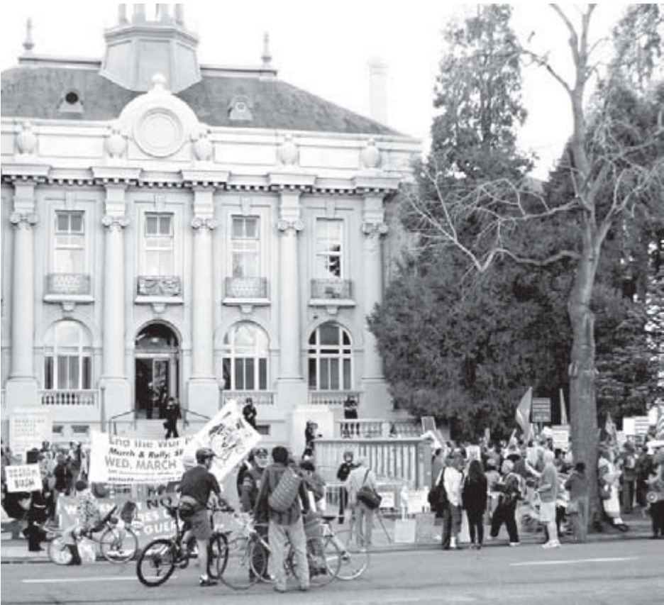
Prowar and antiwar demonstrators face off at Berkeley City Hall February 13 as city council meets to rescind earlier decision to tell Marine recruiters they were “unwelcome intruders.”

After meeting for more than four hours, the city council voted 7–2 not to send the letter to the military recruiters. The council members issued a statement saying that they “recognize the recruiter’s right to locate in our city and the right of others to protest or support their presence.”