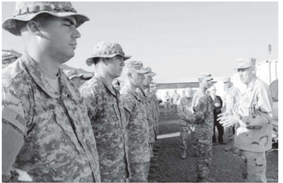
Officers and soldiers of U.S. Combined Joint Task Force-Horn of Africa camp at Lemonier, Djibouti, December 11. The base will be transferred to AFRICOM's command later this year.

spent $750 million training the Liberian military. Bush pledged to continue to support the training as part of the "war on terror."