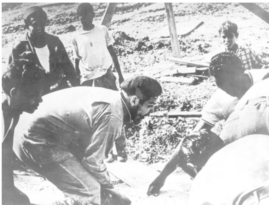
Institute of Cuban History

From a young student rebel attracted to revolutionary ideas, Guevara—like other great communist leaders before him, starting with Marx and Engels themselves—was won to the popular revolutionary vanguard fighting arms in