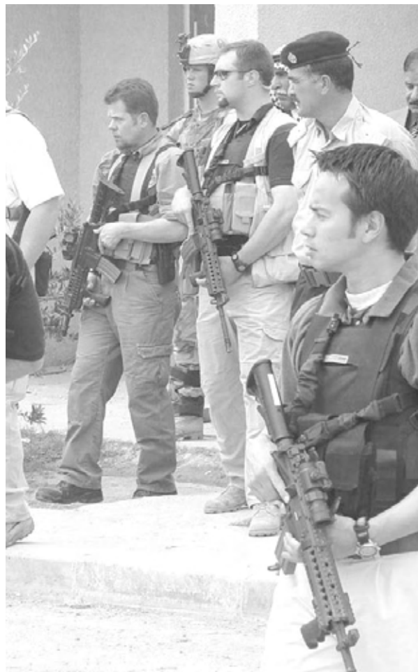
Blackwater USA forces in Iraq. Washington uses 10,800 mercenaries as part of its occupation force in Iraq.