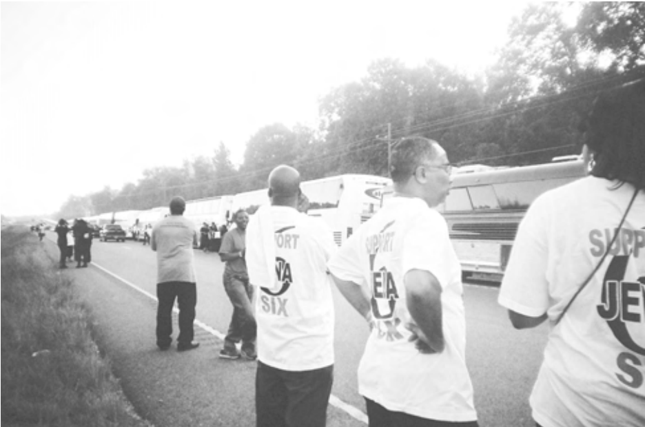
Buses backed up along Louisiana highway as protesters made their way to Jena for rally