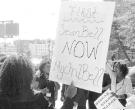
Protest at New York’s Medgar Evers College.

The newscast can be viewed at http://cbs2chicago.com/video/?id=35828@wbbm.dayport.com .