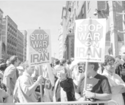
September 24 rally at New York’s Columbia University demands “Hands off Iran!”