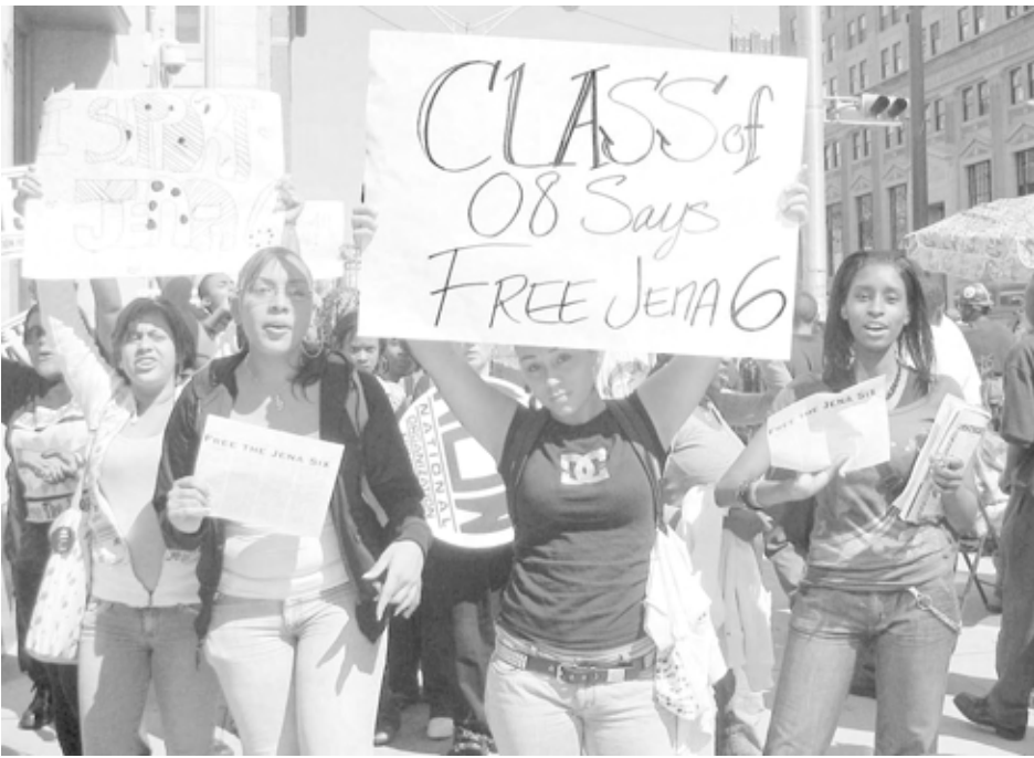
Students walked out of Arts High School in Newark, New Jersey, to join protest September 20.