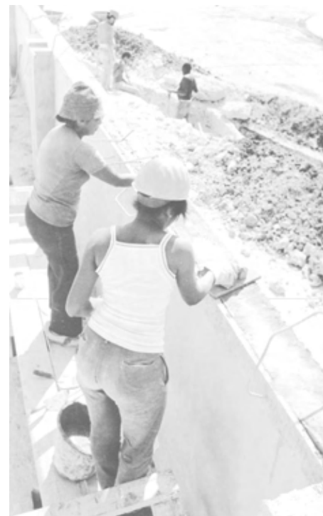
Federation of Cuban Women

“Why do we emphasize voluntary work so much?” asks Guevara. “Economically it means practically nothing.” But it is “important today because these individuals are giving a part of their lives to society without expecting anything in return. . . . This is the