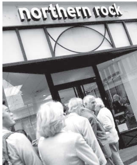
People line up to withdraw money from a London Northern Rock bank September 18.

The demonstrations called for by the party for October 8, throughout the United States, must be supported by every class-conscious worker. We must not leave to the so-called impartiality of the Supreme Court the fate of the Scottsboro boys. We must demonstrate in mass for our demand the Negro boys of Scottsboro do not burn!