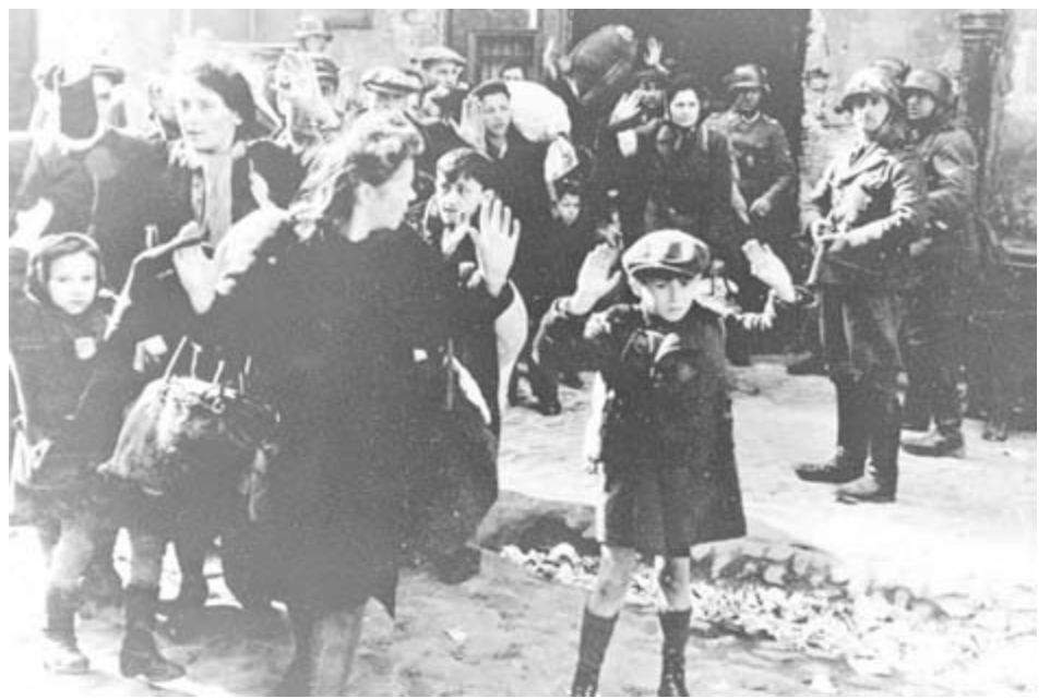
Nazi SS troops round up Jews in Warsaw, Poland, during the invasion of the country by German imperialist forces in World War II. "The world domination of finance capital in crisis: that's the real death trap for Jews today, as it has been all along," says Barnes.

disengagement" as some kind of cure-all has been dealt a rude comeuppance. The conditions for Tel Aviv to hold on indefinitely to a "Greater Israel," however, are no more favorable today than what has evolved over the past decade. The wall will continue to go up, and the Israeli rulers will still be compelled to attend to these unalterable contradictions.