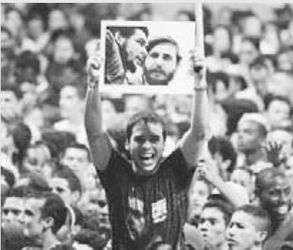
August 12 rally in Havana backs revolution

While the big-business media predicts the imminent demise of the Cuban Revolution, the ‘Militant’ describes how new generations of leaders have been tested and gained experience, answering in practice the question, “What will happen after Fidel?” Don’t miss a single issue!