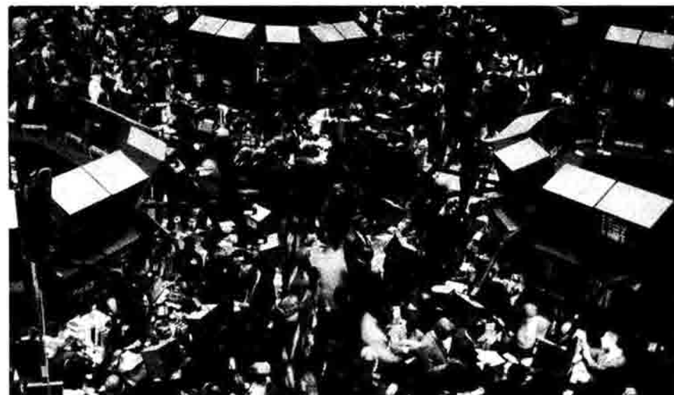
Wall Street traders. Stock market went into a frenzy at the news that Orange County had filed for bankruptcy. Losses by county will severely affect public-service funds.

In addition, the fund refuses to let its customers withdraw money, since its securities aren't worth what they paid for them. So they notified customers that any with-