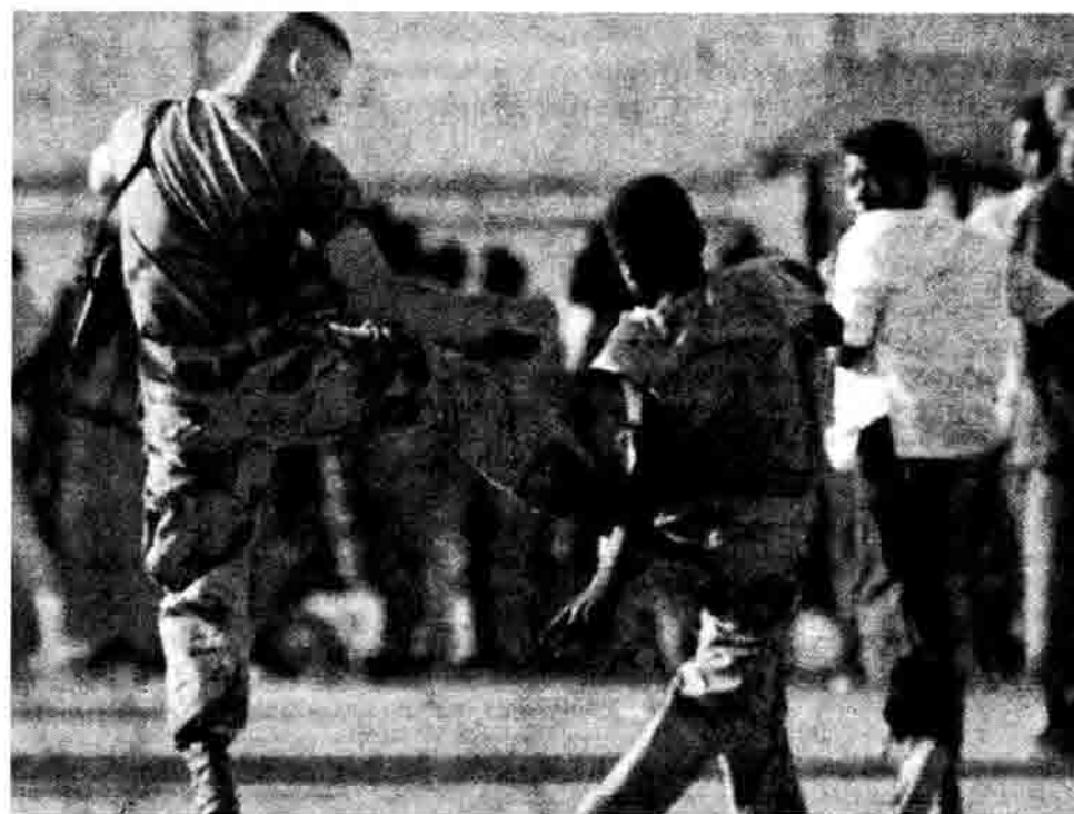
U.S. soldier kicks Somali boy in Mogadishu. Canadian troops are testifying that such abuse was routine.

"It is certainly in our government's interest on behalf of the people to make sure that every question regarding these very unfortunate events is answered and laid to rest," said Defense Minister David Collette. The inquiry will not start before