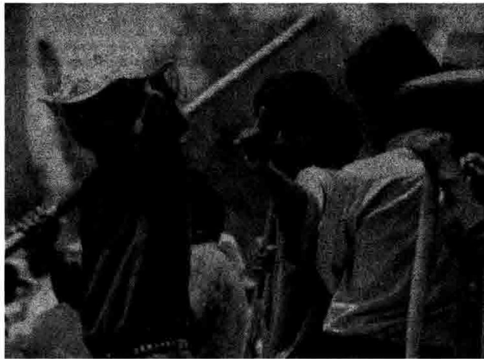
Peasants demonstrating in Mexico City in April 1994 for land reform. Government measures are driving peasants off the land into the cities and factories. In southern state of Chiapas, land seizures and protests are continuing.

force in Mexico's countryside is paid less than the minimum wage of $5 a day, peasant leader Federico Ovalle Vaquero told the Spanish news agency EFE in September.