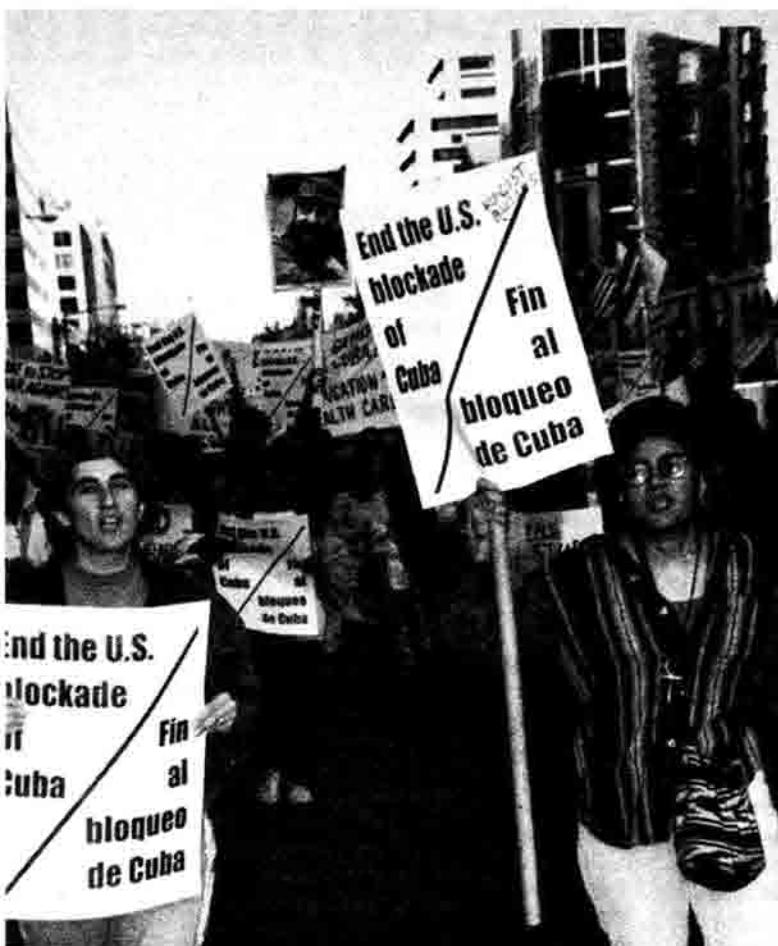
Protest against U.S. embargo of Cuba November 12 in Washington, D.C. Brigade organizers spread the word about the trip among young people there, and many signed up for more information.