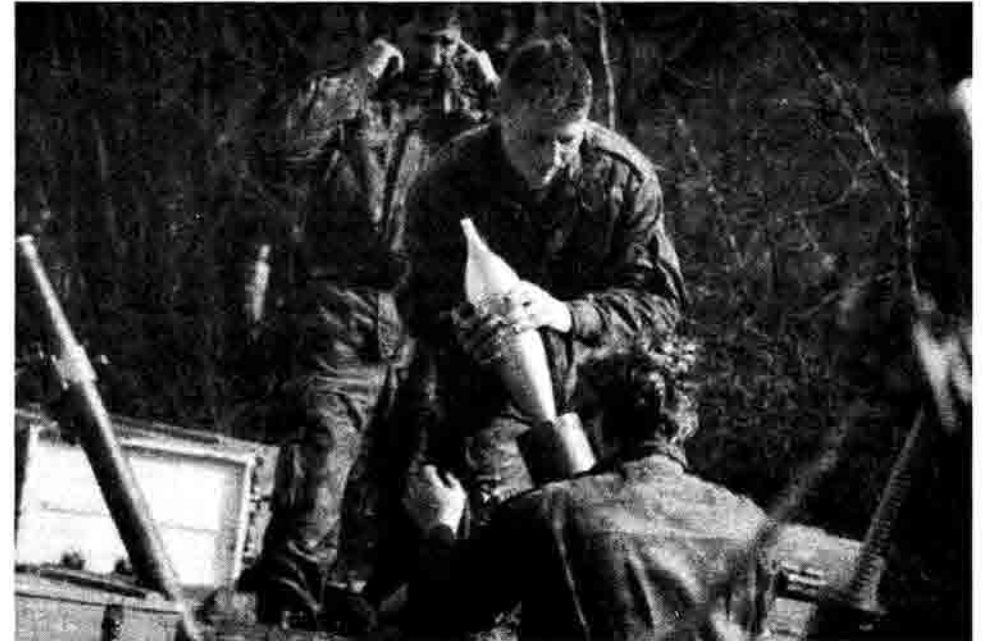
Troops allied with Belgrade regime target Bihac with 120-mm mortar. Sharply conflicting interests between imperialists have come to fore in the Bosnia war.

The Clinton administration has carried out an abrupt about-face in its failed policy toward Bosnia. From urging bombing runs against forces fighting the Bosnian army in the hope they would cease their offensives, the administration has now backed off. The troops fighting under the command of Radovan Karadzic in Bosnia are making continued advances on the ground, and all