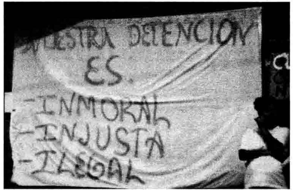
Cuban at Guantánamo detention camp protests conditions with sign in Spanish that reads, "Our detention is immoral, unjust, and illegal."

Trying to recover lost credibility, right-wing Cuban-American groups have been campaigning for the release of the detained refugees. They are currently raising millions of dollars to privately finance the resettlement of the 8,000 children and parents. As anger among Cuban-American working people grew over the incarceration of their relatives under appalling conditions, the rightist businessmen had become somewhat discredited by their close