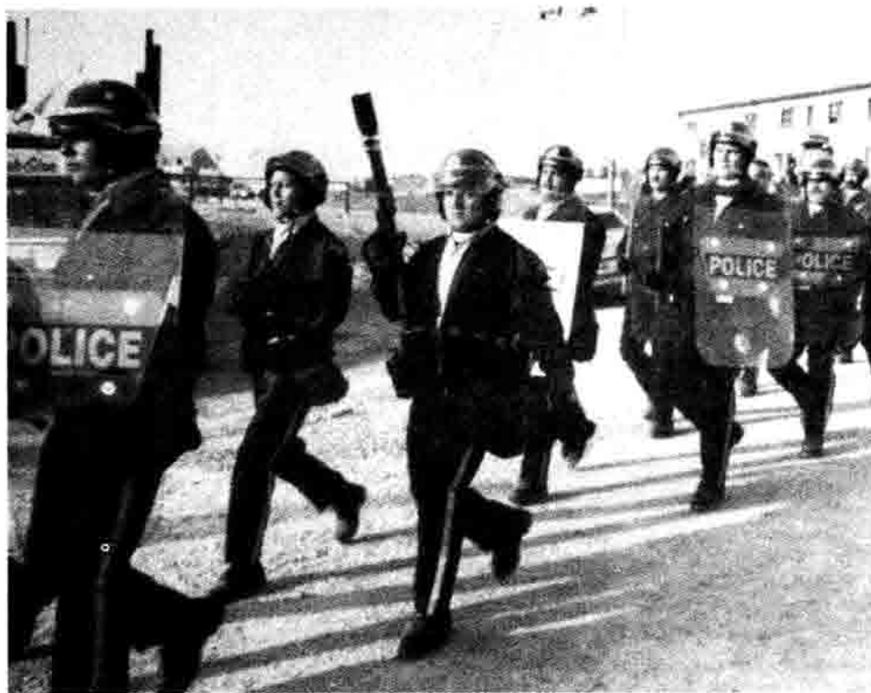
Royal Canadian Mounted Police riot squad marches into Royal Oak gold mine during strike, June 1992. Cops attacked strikers with tear gas and fired weapons into the air. Police investigators badgered miners they questioned about deaths of nine scabs.

The company used Pinkerton thugs and Royal Canadian Mounted Police (RCMP) riot troops against the strikers. A rally at the mine entrance June 14, 1992, resulted