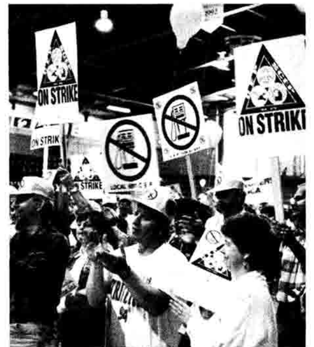
September 10 rally of striking Irving Oil workers.

"The government should shut that refinery down or get the workers who know how to do the job back to work!" LeBlanc