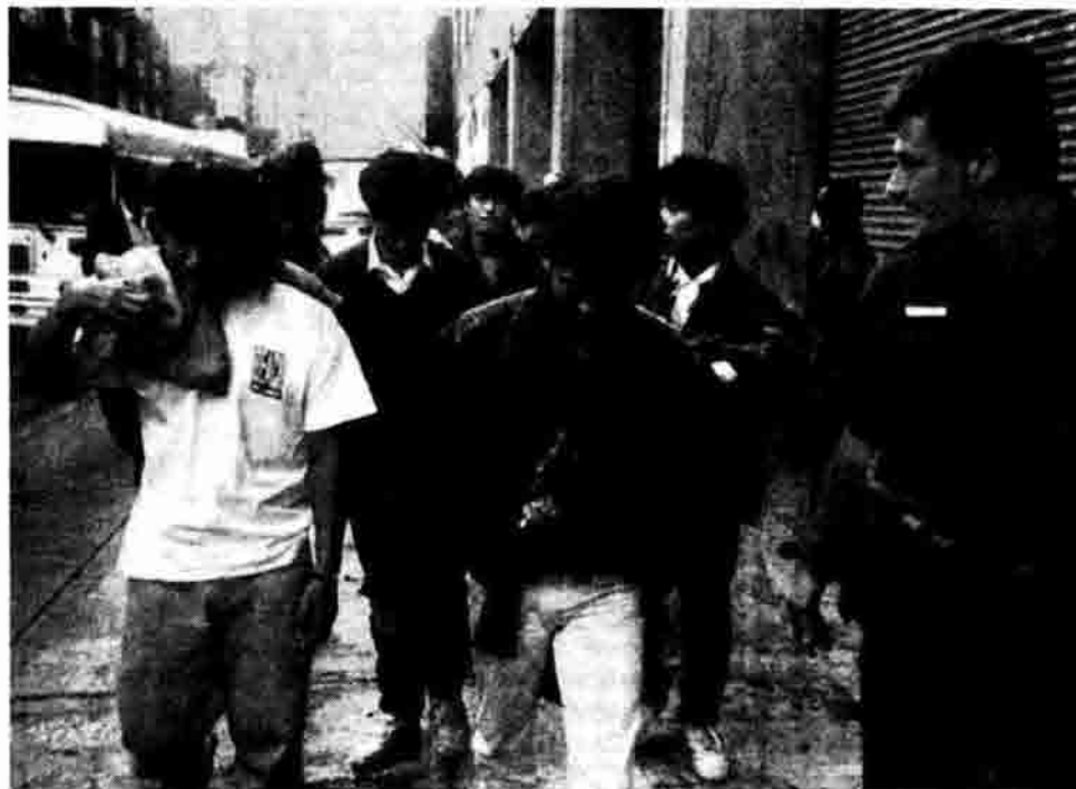
Chinese immigrants in handcuffs before boarding bus for INS detention center

Passengers said they were held in the dark hold of the ship with no shower, no furniture, and one toilet for the 300 to share. They were fed only once every day or two during the four-month journey. Sometimes that meal was just a bowl of rice. Some refugees told interviewers they paid as much as $60,000 for the trip. Others said they had paid no money but promised to work and give up to 80 percent of their wages for passage. Authorities said workers in that situation typically put in 12-14 hours a day, seven days a week. They work mainly in restaurants, as pros-