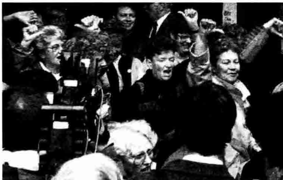
Timex workers in Scotland after June 3 meeting where they rejected concession plan

The union voted February 14 to accept the layoffs plan and returned to work under protest. But when workers arrived at the plant the next day they found the gates locked and police waiting outside to prevent