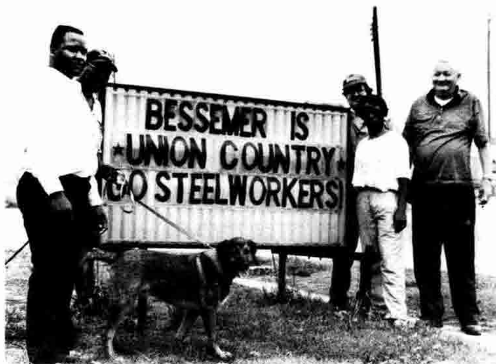
United Steelworkers members, pictured above, won solidarity from many other unions in their strike against Trinity Industries in Bessemer, Alabama.