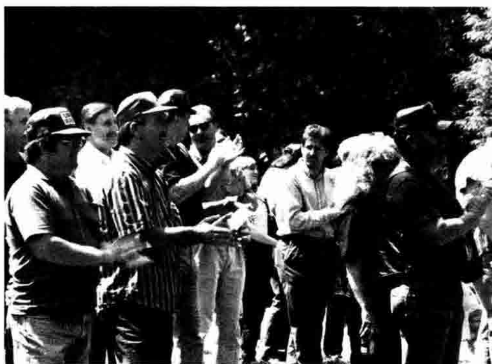
Marrowbone miners at picnic a few days before they voted for the UMW. At other nonunion mines in southern West Virginia and eastern Kentucky, miners are also approaching the union for help in organizing.

Creek miner who is helping lead the union-organizing drive, says the company is taking a softer approach than the harsh antiunion propaganda they used at Marrowbone. For the last two months, he said, the company significantly increased the production bonuses miners receive.