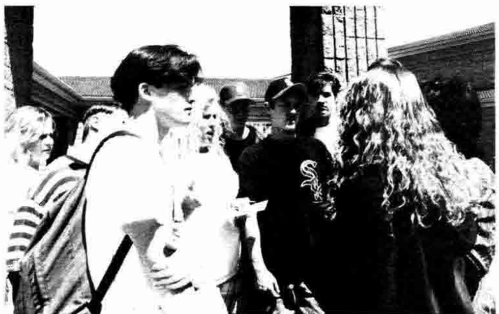
High school students in Bremerton, Washington, discuss antigay ban.

The vote on the proposed amendment sparked discussion among students on broader social issues. One student who opposed the discriminatory measure said some of those who campaigned for it aren't just against gay rights but oppose a woman's right to choose abortion and other democratic rights.