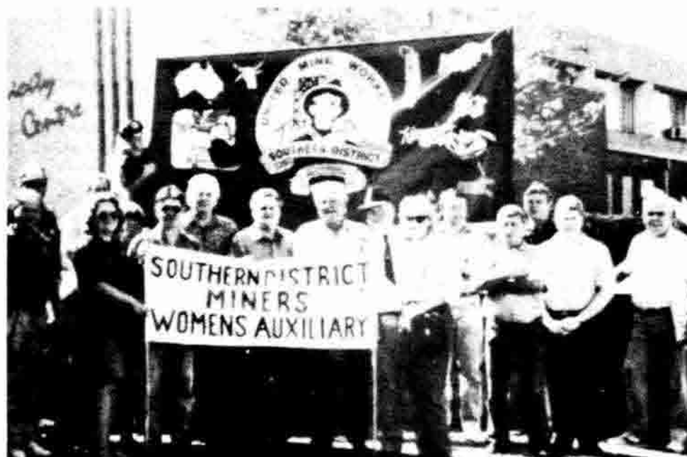
Common Cause Australian United Mine Workers members and supporters at May Day march in Wollongong, New South Wales. Miners at Peabody mines in Australia staged 24-hour work stoppage June 3 in solidarity with U.S. coal strike.