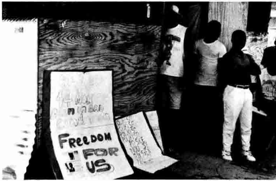
Haitians detained at U.S. naval base at Guantánamo Bay, Cuba. A U.S. federal judge ordered their release and the closing of the camp. One thousand people poured into the streets of Little Haiti in Miami to celebrate after the ruling.

The official unemployment rate among youth aged 16 to 19 in New York City rose to 40 percent in the first three months of this year. The rate is more than double the national average and the worst in the 25 years that records have been kept. The statistics do not include large numbers of youth who have grown discouraged and have stopped looking