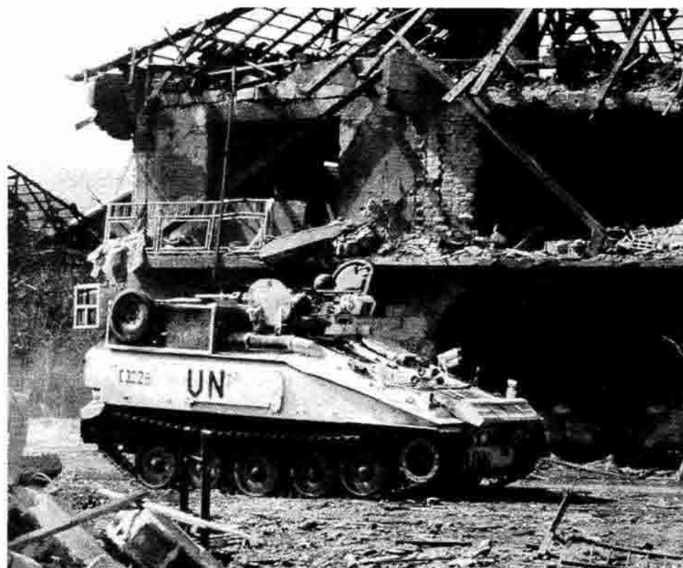
UN tanks on patrol in downtown Vitez. Security Council has called for sending 10,000 more troops to Bosnia and for the first time has authorized air strikes.

In several days of fierce fighting between the Bosnian army and rightist Croatian forces in the Bosnian city of Travnik in early June, Bosnian government troops carried out some "ethnic cleansing" of their own. Hundreds of people were killed as the Bosnian army forces drove Croat troops and some 3,000 Croat civilians out