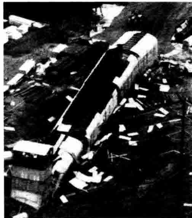
Entrance to Westray coal mine in Nova Scotia after explosion that killed 26 miners in May 1992.

Curragh was under severe financial pressure to mine coal following the explosion. The lucrative contract it received from the Nova Scotia government for opening Westray was needed to help its money-losing lead and zinc mines in western Canada. But now a bankruptcy court