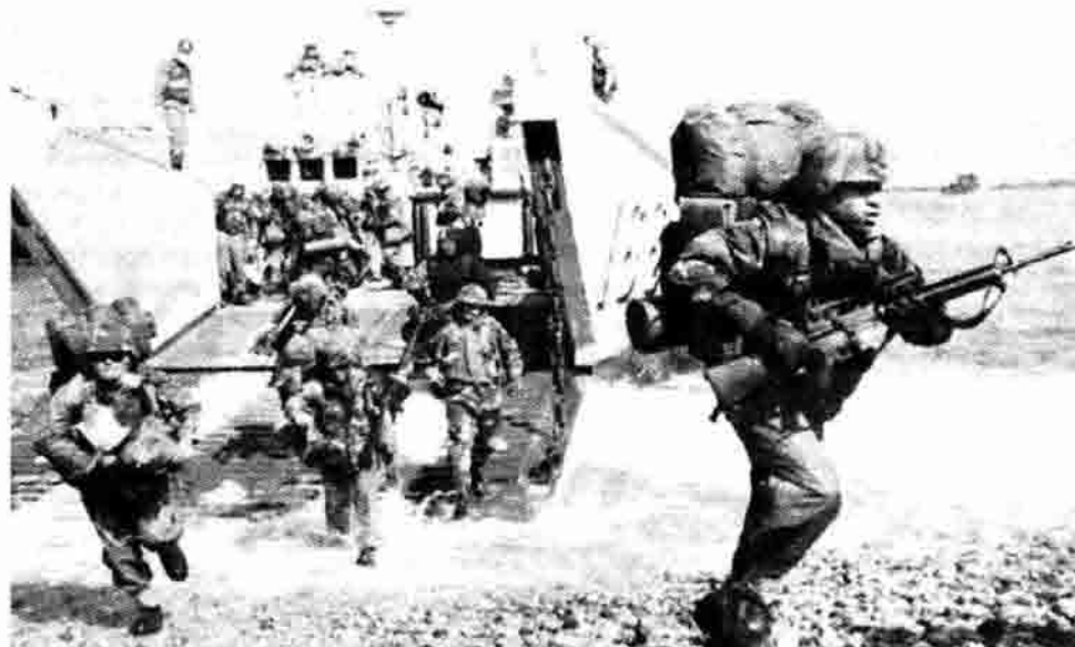
U.S. marines practice mock invasion during recent "Team Spirit" maneuvers in S. Korea.

The demonstrations have occurred as a growing number of public officials in Ireland and the British-occupied North have called on the British government to end its refusal to talk to Sinn Fein, the main party calling for British withdrawal from northern