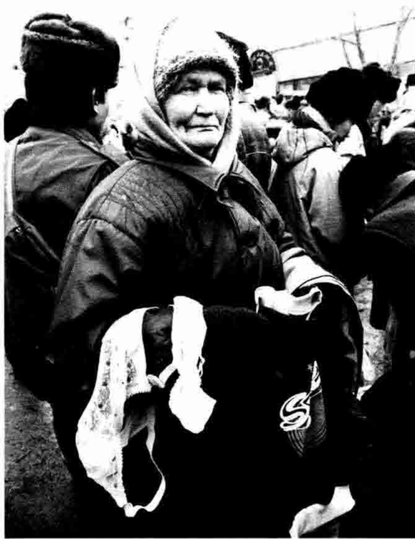
Street vendor in Novosibirsk, Siberia. Thousands of Russians are trying to grapple with unemployment and other effects of economic crisis by peddling clothes and other goods in the streets.

The Clinton administration, which is considering asking Congress for up to $1 billion in new aid for Russia, is urging the International Monetary Fund (IMF) to provide much larger sums. Washington announced that it wants the IMF to provide Russia with