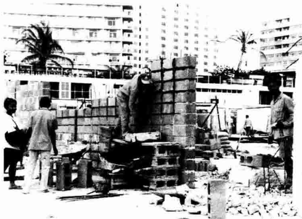
Rebuilding in Havana after March 13-14 storm. The damage caused by the storm equaled half of the hard currency Cuba has available for food, oil, and other supplies.

At least four people were killed and 95 injured by the storm and subsequent flooding that caused damage in 8 of Cuba's 14 provinces. More than 36,000 homes were damaged; almost 1,500 of these were completely destroyed. In addition many work places and service centers were affected, including hospitals, schools, and industries. One of the two largest overhead cranes in the country was destroyed as well.