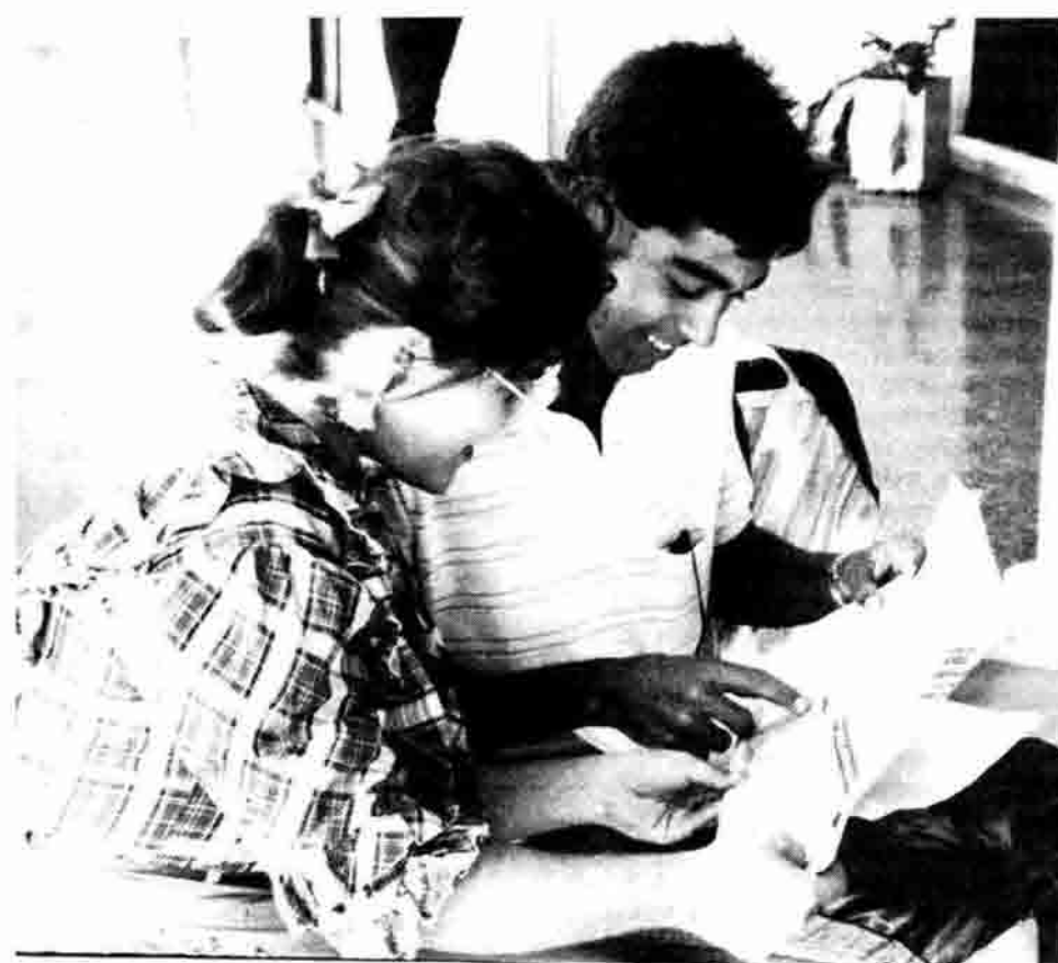
Students reading Perspectiva Mundial at the University of Matanzas

Of no less importance for Cubans was learning positions and conflicts that exist within the United States concerning Cuba-U.S. relations, where the hostility and blockade by this enormous power against a small but firm Caribbean island have for a long time showed signs of unjustified stubborn-