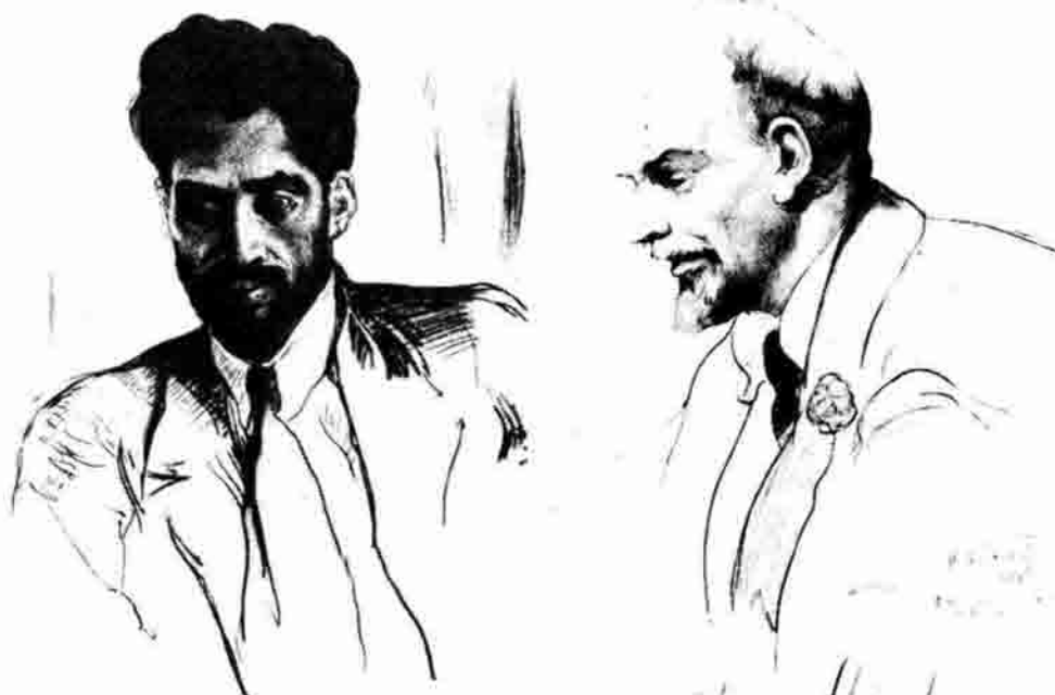
M. N. Roy (left), delegate from India, and Bolshevik leader V. I. Lenin at Second Congress of Communist International. Drawings are by Isaac Brodsky.

Some of the debates now have a dissonant ring, particularly the arrogant tone taken