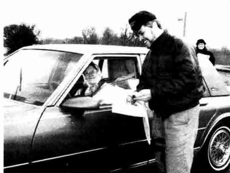
Selling the Militant at mine portal in southern Illinois