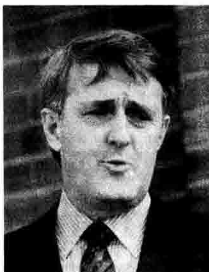
Prime Minister Brian Mulroney

This is reflected in the foreign policy of the Canadian rulers. In the last several years Ottawa has made a shift toward more open backing of U.S. foreign policy. Mulroney's decision to send 2,000 troops to back Washington's efforts in its 1991 war against Iraq was the first direct use of Canadian troops in an imperialist-led war since the Korean War in the early 1950s, Penner noted.