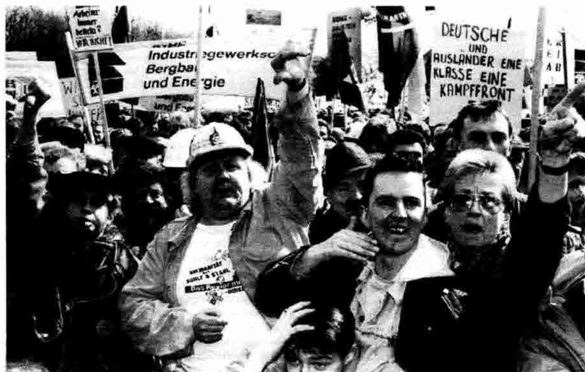
Some of the 70,000 steelworkers and supporters who marched in Bonn March 26. Placard on right says, "German and foreign workers, one class, one united fight."

The bosses are reneging on a 1991 agree-