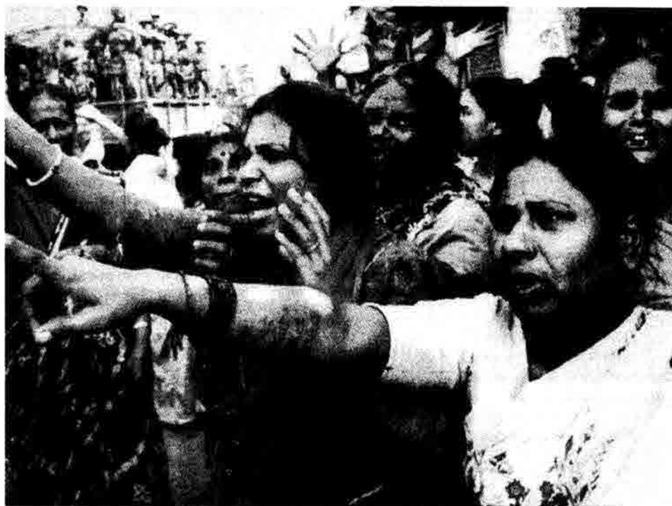
Hindu and Muslim women march together in Bombay to protest police brutality

BJP deputies are demanding a government inquiry into the extent of damage done to Hindu shrines in India. They have organized protests at the embassies of Pakistan and Bangladesh, accusing Muslims of being