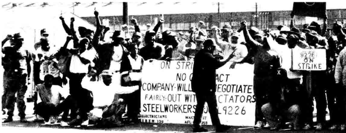
Strikers' picket line in front of Trinity Industries in Bessemer, Alabama. Solidarity for the strike remains strong.