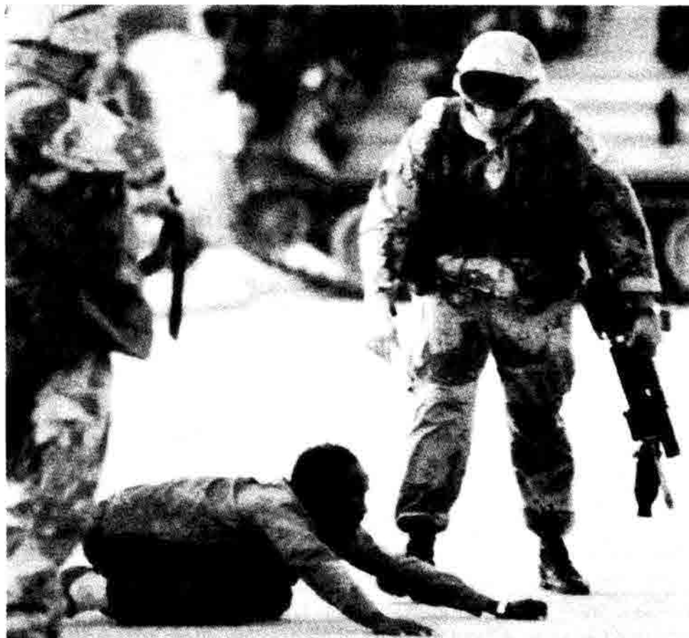
U.S. invasion of Somalia, expected to involve nearly 50,000 troops from several countries, aims to establish a stable client regime.