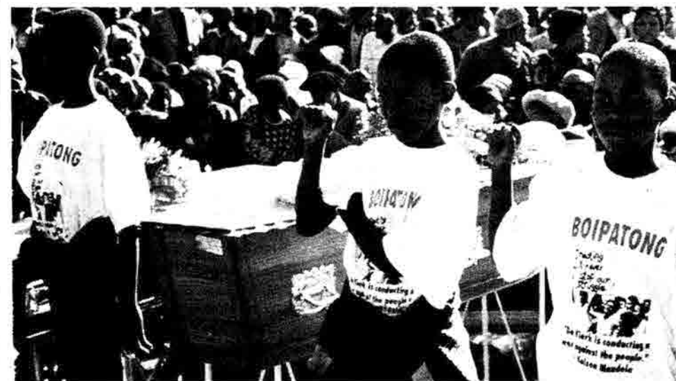
Youth at funeral for victims of Boipatong massacre in September. De Klerk's firing of top generals is strongest admission to date of involvement of security forces in violent attacks on democratic movement.

The opposition Conservative Party denounced de Klerk's action as a "witch hunt" and expressed its support of the accused military officials.