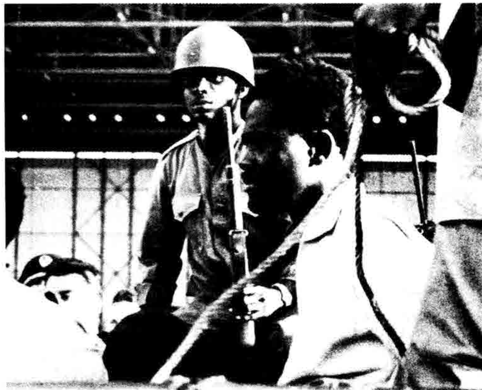
Patrice Lumumba (center), independence fighter and first prime minister of the Congo, being held prior to his murder, months after U.S.-backed coup.

Determined to maintain its hold over the Congo's resources, Belgium's rulers backed an antigovernment rebellion in Katanga province, the site of major deposits of uranium, cobalt, copper, and other resources owned by U.S., British, and Belgian capitalists.