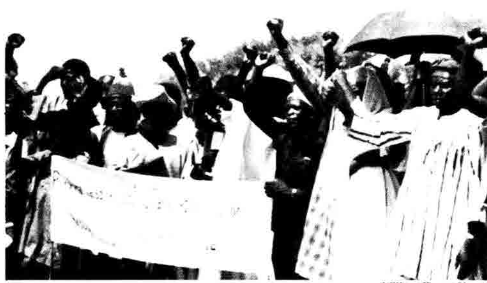
Peasants' rally in Burkina Faso in October 1987. Banner reads: "Farmers of Burkina Faso: hoes yesterday, hoes today, machinery tomorrow."

nomie, social, and environmental conditions in Africa. Burkina Faso was confronted with many of these problems when the revolutionary government took power on August 4, 1983.