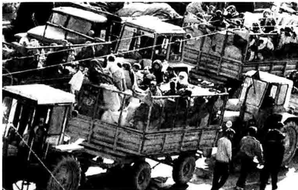
Refugees escaping from fighting in Tajikistan wait to enter the capital of Dushanbe

Russian president Boris Yeltsin announced at the end of November that his government was suspending military aid to North Korea. Moscow is now curtailing