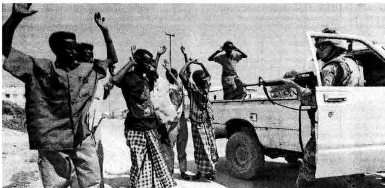
U.S. marine threatens group of Somali youngsters in northern Mogadishu December 13

As the U.S. rulers debate how to proceed, Somalis continue to be harassed, shot at, and killed. Marines shot to death three Somalis outside the U.S. embassy in Mogadishu, on the evening of December 15, for example. The media downplayed this story as they continue to focus on fact that no U.S. Marines have so far lost their lives.