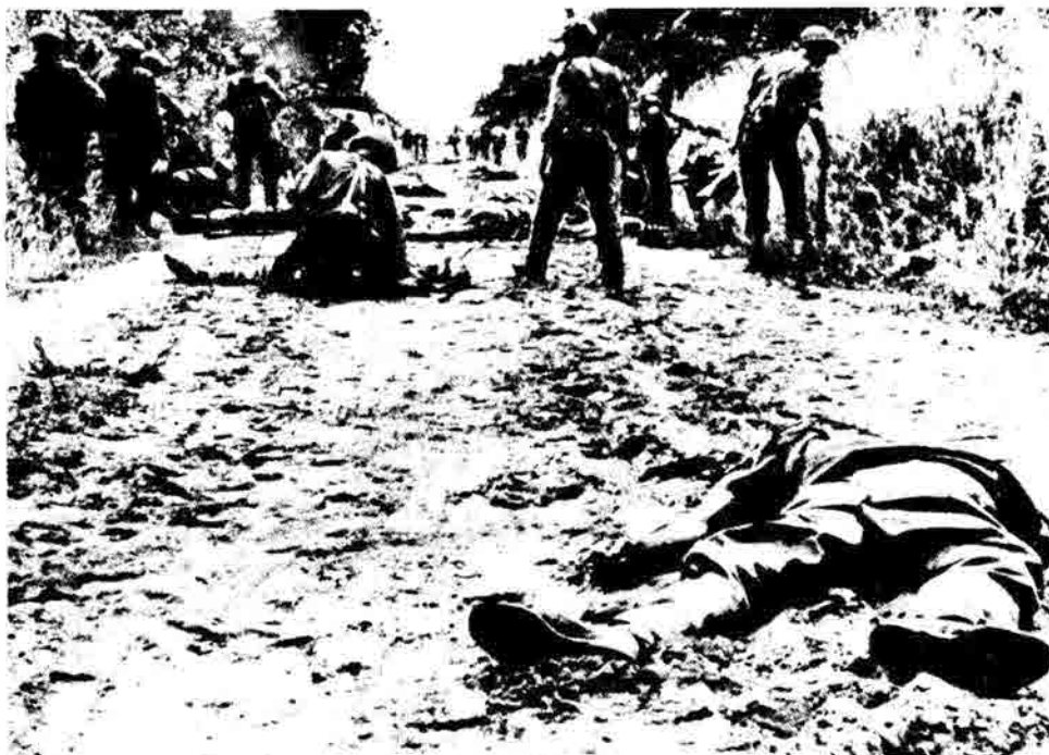
U.S. financed and armed mercenaries on deadly march to Stanleyville in November 1964. So many bodies were left in the streets there that a typhoid epidemic broke out.

We condemn the way in which the intervention by United Nations forces was carried out in the Congo. First of all, the UN forces did not go there to counter the invading forces, for which they had originally been sent. All the time necessary was given to bring about the first dissension [within