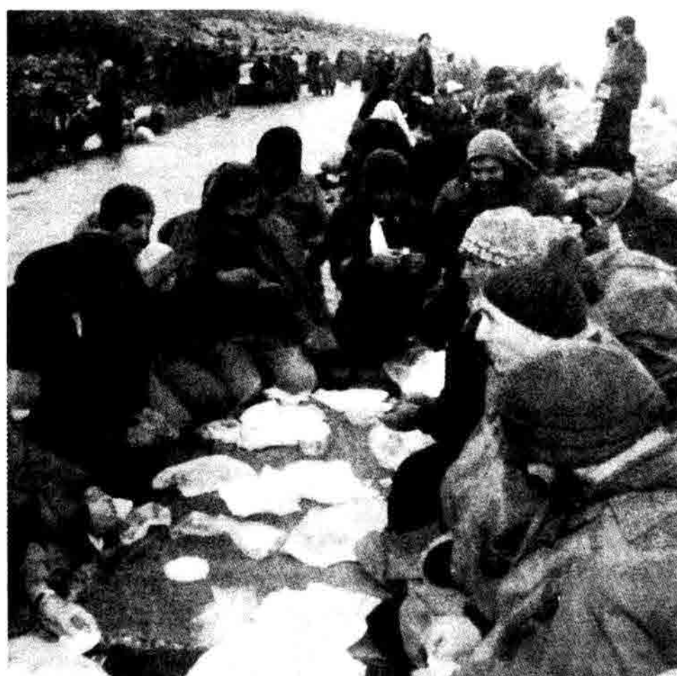
Deported Palestinians stranded on strip of land between Lebanese and Israeli checkpoints. Mass expulsion sparked international condemnation.

Israeli forces conducted mass sweeps arresting more than 1,600 Palestinians who were accused of being Hamas supporters. About one-quarter of them were later deported. A Palestinian journalist who worked for several foreign news organizations, including the New York Times , was among