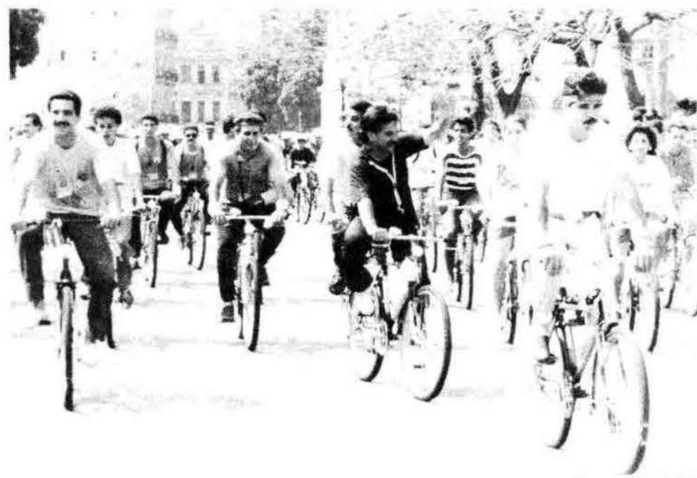
Delegates rode bicycles to all sessions of Cuban youth congress. Roberto Robaina (pictured in center with hand in air) was reelected first secretary of the UJC.

The congress was capped off with a speech by Cuban president Fidel Castro, carried live on national TV and radio. Later that evening tens of thousands of youth gathered in the Plaza of the Revolution where Robaina read the manifesto of the congress and a concert was held. Large segments of the congress itself were carried on TV during the week following the gathering.