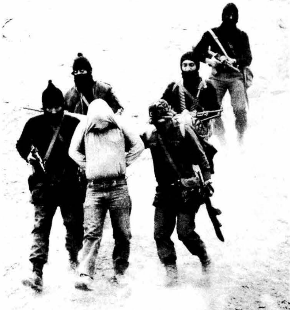
Peruvian soldiers with alleged guerrilla. The army has massacred the entire male population of some towns where Shining Path operates.

The Internationalist Workers Party (POI), on the other hand, subscribes to the Marxist criticism of the political adventurism of the Stalinists, constantly opposing to individual terrorism the organization of the masses.