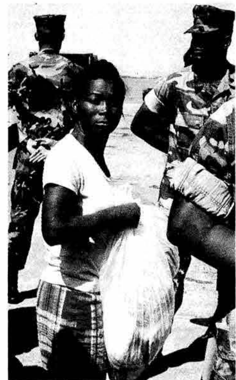
U.S. judge ruled Haitians at Guantánamo base (above) have right to lawyer.