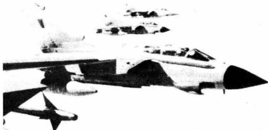
British Tornado fighters used against Iraq in 1991. U.S. planes based in Britain have begun bombing practice in preparation for military action against Libya.

This problem underlay the conflicts within the Thatcher administration. The decision of the Thatcher government, for the British pound to shadow the German mark