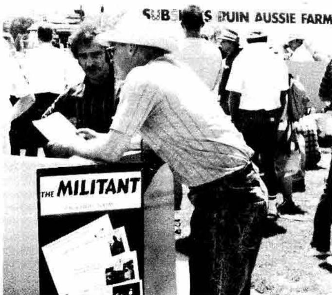
Selling 'Militant' at farm protest in Canberra, Australia.

Campaigning with the Militant is the best way to build the kind of movement necessary for leading youth, working people, and others in the struggles of today and tomorrow. Achieving the goals in this subscription effort is an essential part of the next steps toward that end.