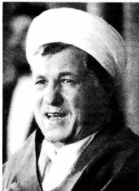
President Hashemi Rafsanjani of Iran. Iranian raid on Iraq was first since 1988 cease-fire between the two countries.

There have been struggles by workers for better conditions. One diplomat told the Washington Post that he had counted 2,000 ministrikes in the past six months.