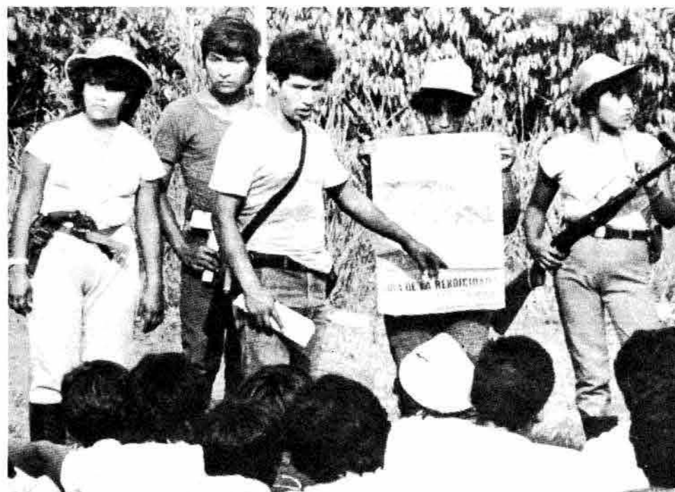
Shining Path members at training camp. The group appeals to the most impoverished and desperate layers of society. It wins a hearing due to the depth of the economic and social crisis in Peru and the bankruptcy of the major political parties.

Militant supporters sold 21 copies of the paper, as well as several copies of the French-language socialist publications Nouvelle Internationale and L'Internationaliste and some Pathfinder literature.