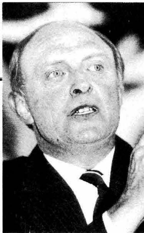
Labour Party leader Neil Kinnock (left) and Prime Minister John Major of the Conservative Party. On major questions the capitalist parties are united against workers.

Through measures dubbed "people's capitalism" and "shareowning and homeownership democracy," the Conservative government won the support of the middle classes and of large sections of the highest-paid workers. These measures included a wage policy that favored the better-paid; sales of council