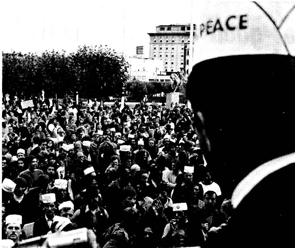
GIs FOR PEACE. Scene at Oct. 12 San Francisco rally where 500 GIs joined with 15,000 civilians in demanding an end to Vietnam war. Action proved a big stimulus to antiwar efforts by GIs nationally.