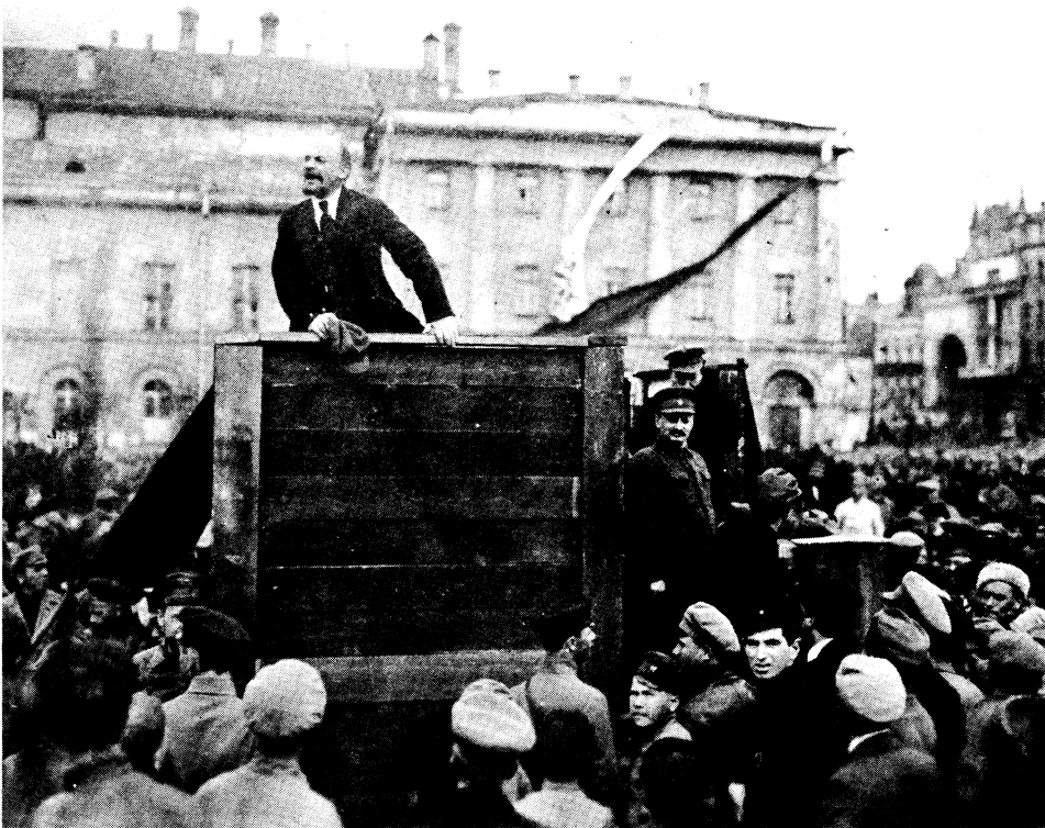
LENIN AND TROTSKY, during 1918-21 civil war. Lenin (on stand) warned early of danger of bureaucracy in new soviet state; Trotsky led battle against Stalinist bureaucratism in USSR after Lenin's death.

"He hated not only them but also the order they had created. He tirelessly repeated Lenin's words, 'There is nothing harsher and more soulless than a bureaucratic machine.' Therefore he believed that a Communist had no higher task than to destroy this machine."