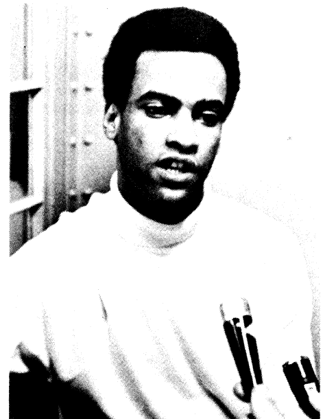
Huey P. Newton