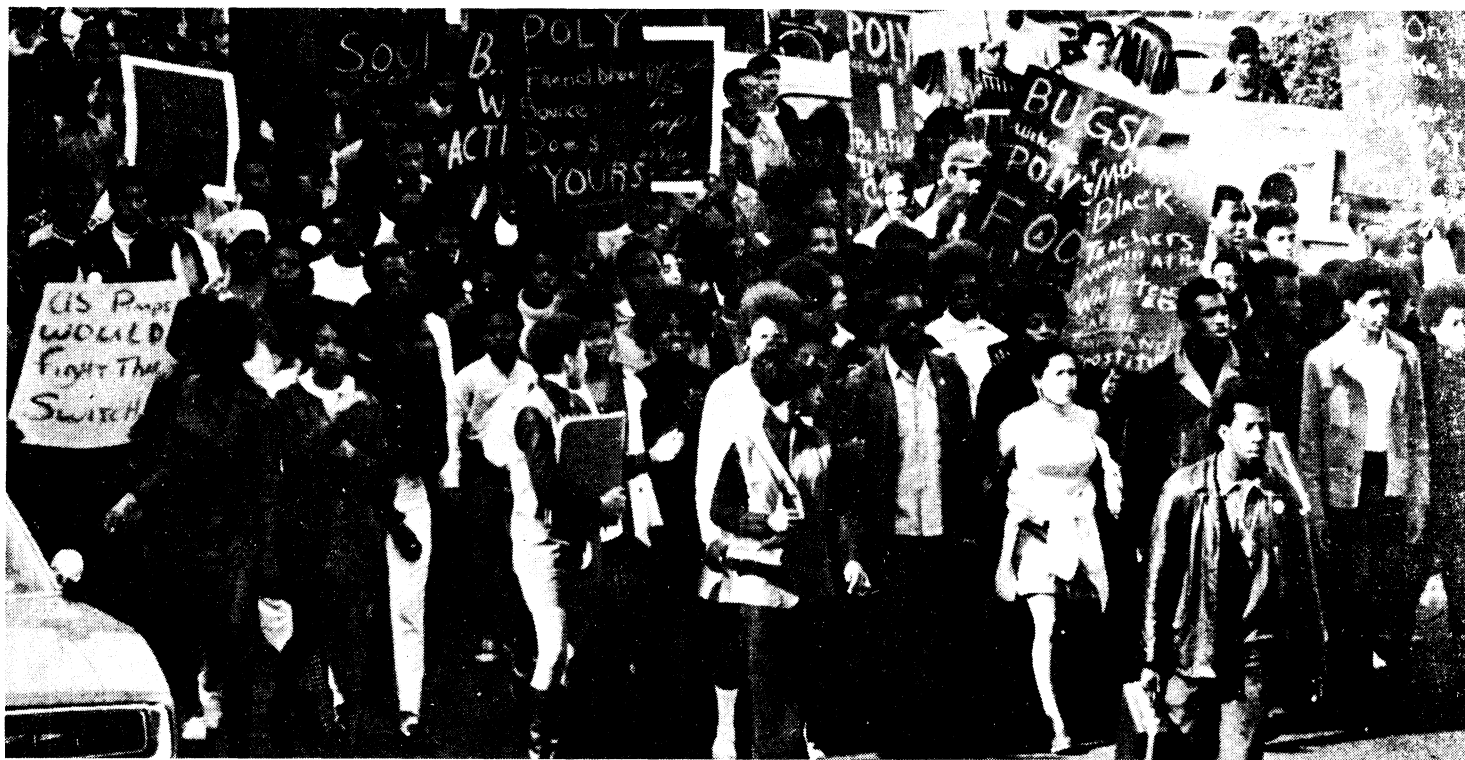
Students at San Francisco Polytechnic High march on City Hall

Over the past year several student groups were organized to improve the conditions at Poly; however they didn't really take hold, and the rotten conditions at Poly persisted.