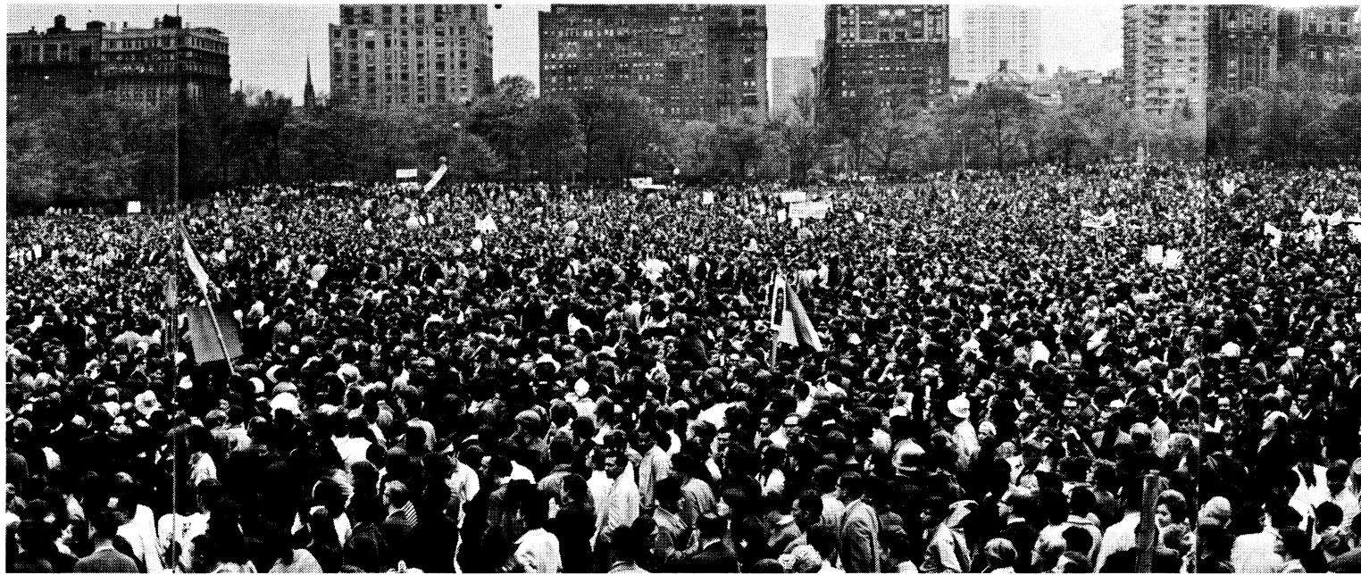
Nixon can be sure of seeing antiwar demonstration like this one in New York's Central Park last

Goldwater corralled the ultrarightist vote in 1964, but that vote was mixed in with regular Republican votes, and it is impossible to make comparisons. We can say that there is little evidence outside the electoral arena—as manifested in demonstrations, rallies, etc.—that ultrarightist forces have grown considerably in the past few years. Quite the contrary, except for the crowds at the Wallace cam-