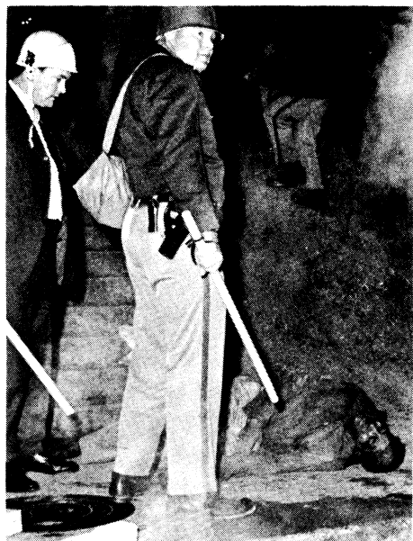
A RACIST CRIME. State highway police stand over wounded black students shot down during outbreak at South Carolina State College in Orangeburg, S. C., last February.