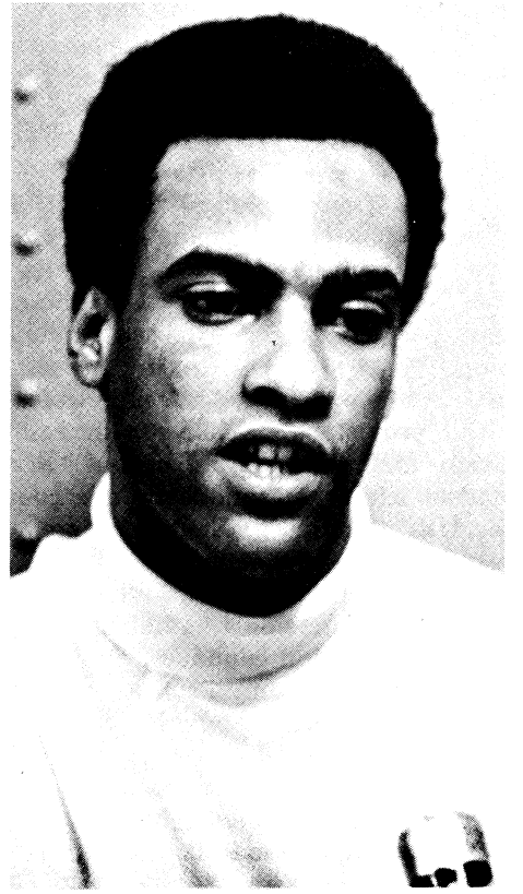
Huey P. Newton