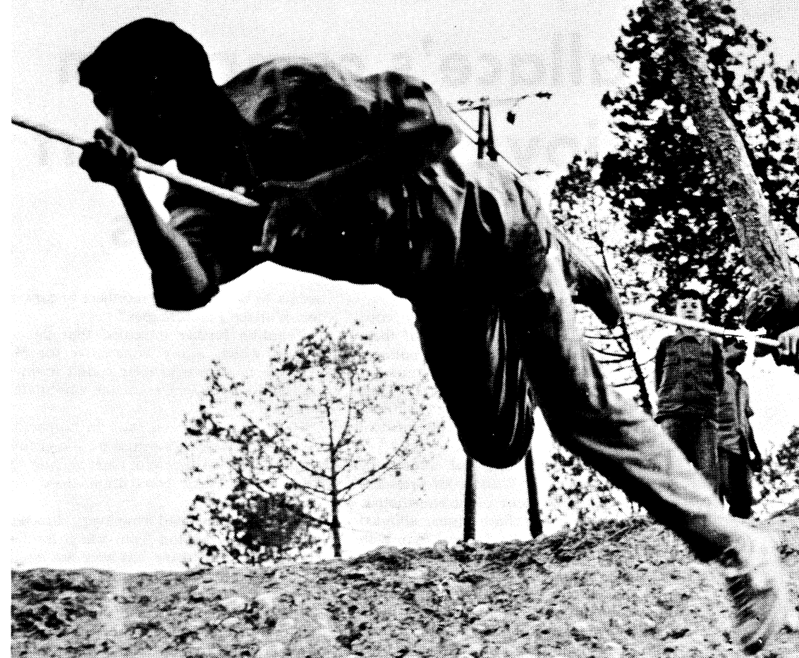
Al Fatah commandos (above and right) training somewhere in