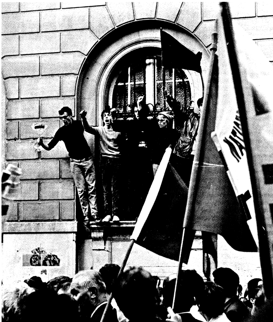
From "Revolt in France": Photo of high school students by Hermes.

"It undermines the unity of the international Communist movement. It deals an additional blow to struggles like that of the Greek people against regimes set up by material force and by foreign imperialist intervention."