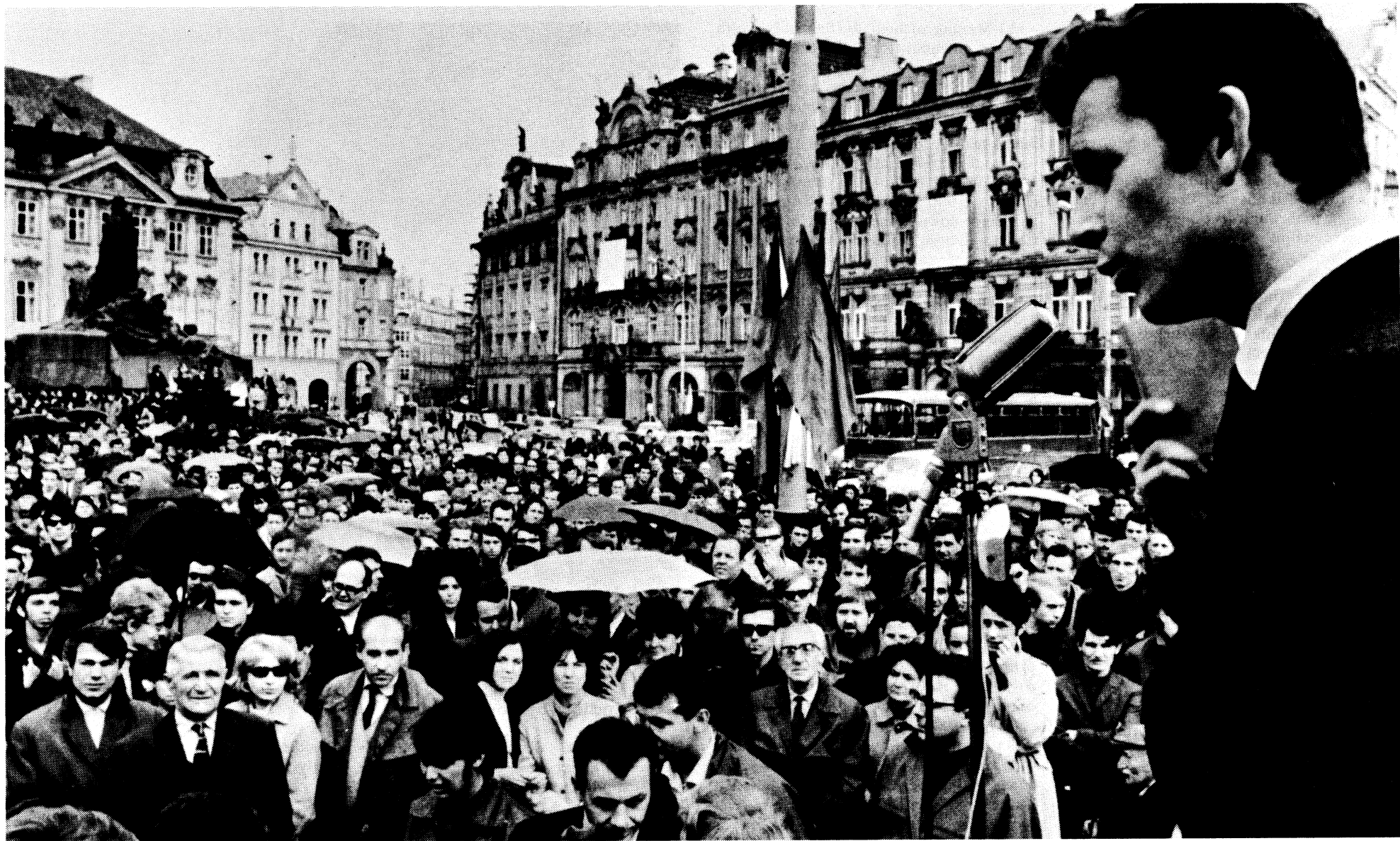
MASS RALLY. Speaker addresses rally organized by young people in Prague, Czechoslovakia, on May 4. Meeting held in support of greater democracy.