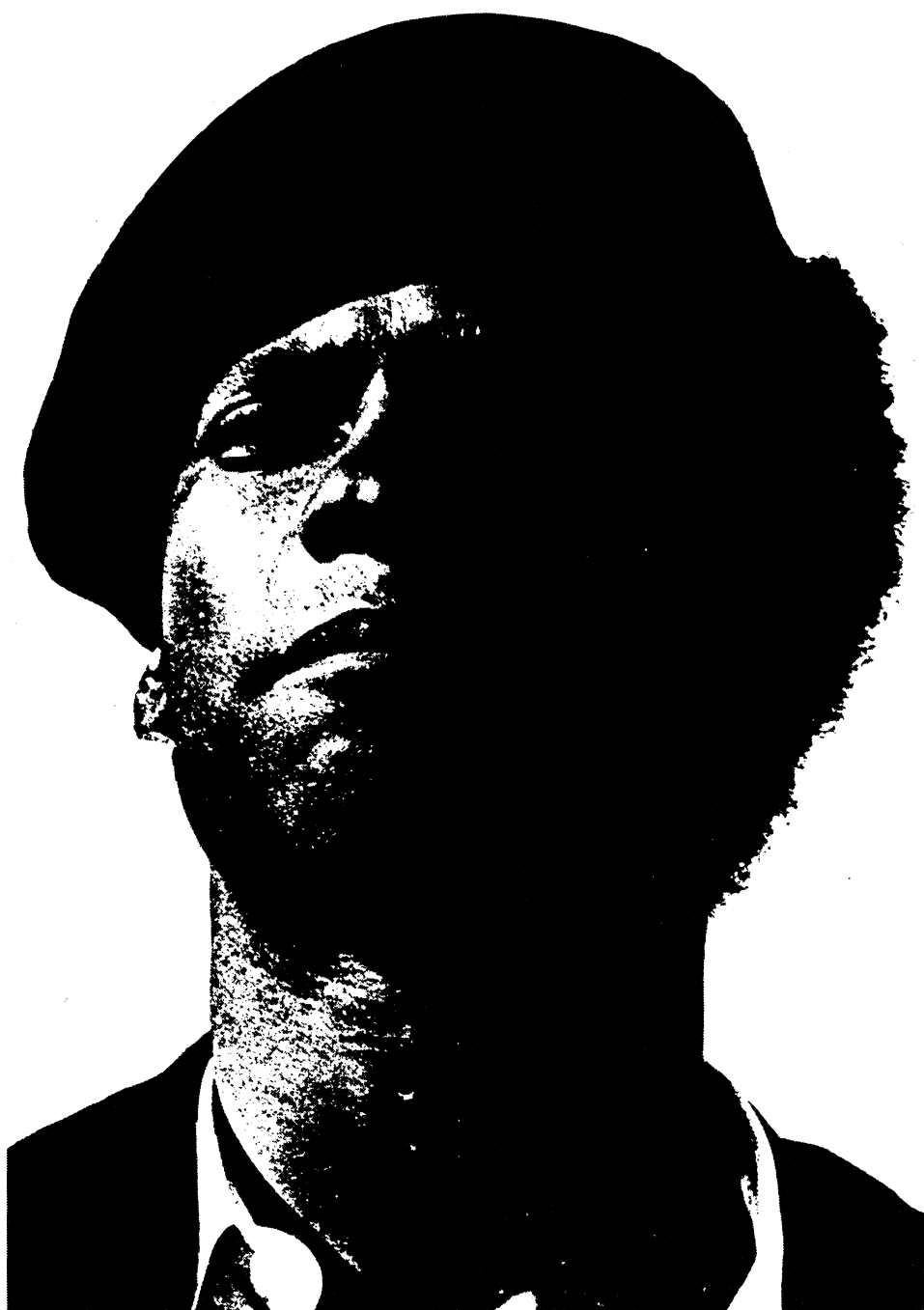
HUEY P. NEWTON