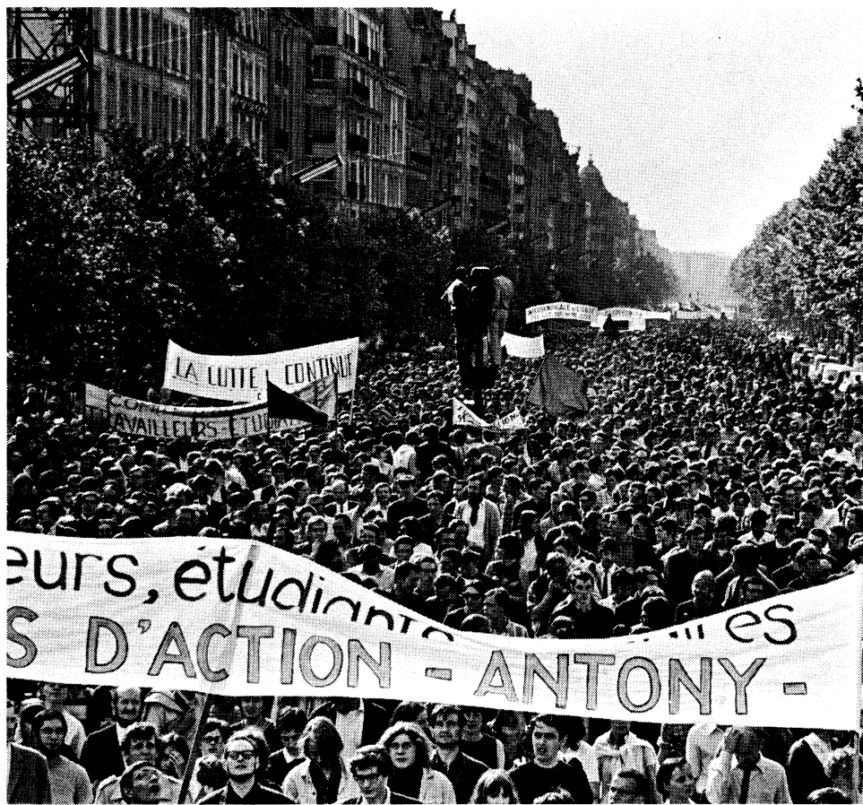
THE WAY TO DO IT. One of a series of mass student demonstrations in Paris during spring revolutionary upsurge. Mass student actions served to spark similar actions by working class.