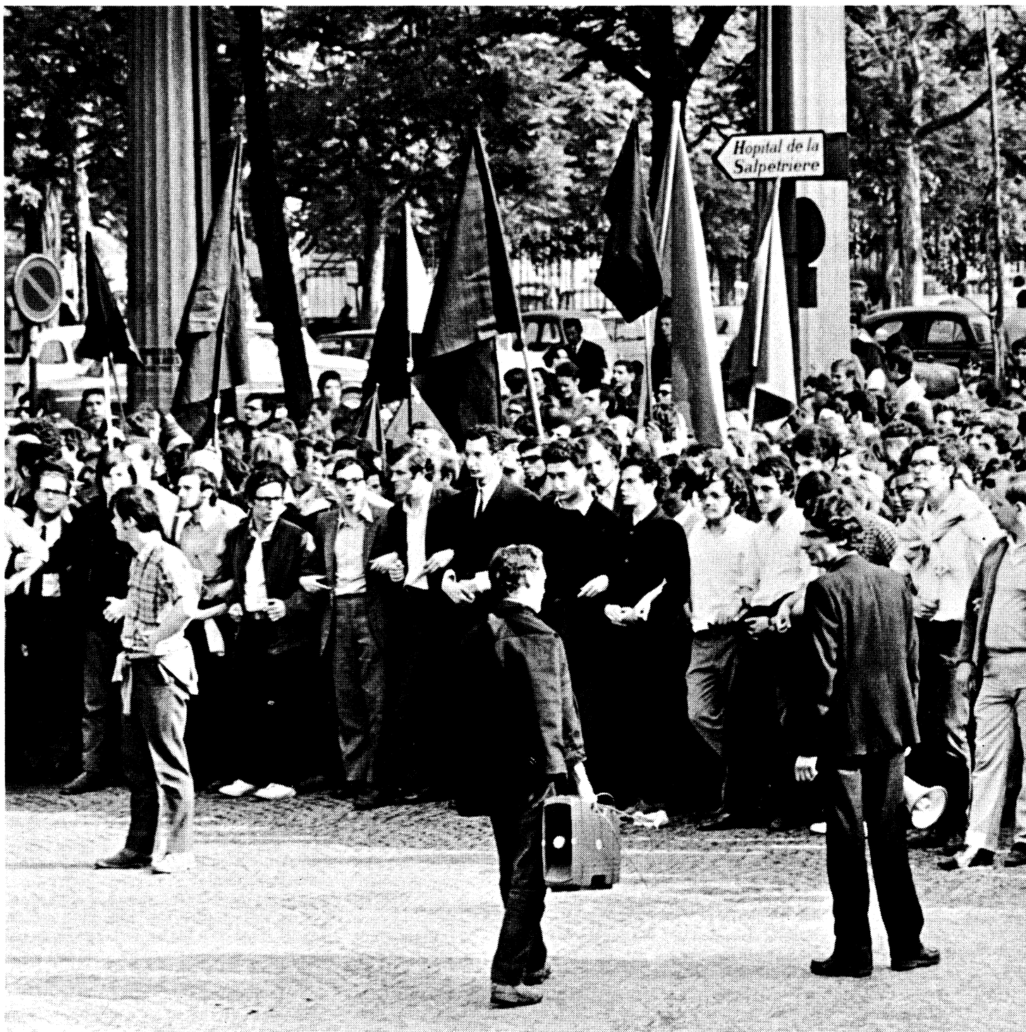
REVOLUTIONARY LEADER. Alain Krivine, in front at right, led huge demonstration of students in Paris on June 1.