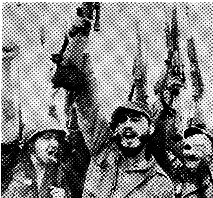
REVOLUTIONARIES. Cuban guerrillas in the hills of the Sierra Maestra during struggle against Batista.

"Anyone can have 'Eagle' for a last name without having a single feather on his back. In the same way, there are people who call themselves Communists without having a Communist hair on their head. The international Communist movement, to our way of thinking, is not a church, it is not a religious sect or Masonic Lodge that obliges us to hallow any weakness, any deviation, that obliges us to follow the policy of a mutual admiration society with all kinds of reformists and pseudo-revolutionaries.