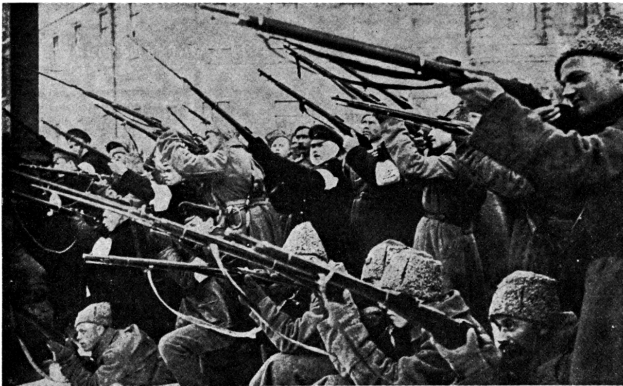
FIRING AT CZAR'S POLICE. Workers in Petrograd began revolution which toppled Romanov monarchy.

In England, France and the United States it was the new class of industrial capitalists that led the great democratic revolutions of the 17th and 18th centuries. The democratic revolution was postponed in Russia until the 20th century — and when it came it was carried out not by the capitalist liberals, but by the working