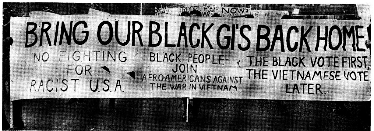
MAKING THE POINT. Sign carried in the March 26, 1966 massive antiwar march down Fifth Avenue in New York.