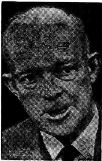
General Eisenhower Advises Peace Movement

The essence of the statement is pure political reaction veneered with transparently fake liberalism. Its principal concern, the sponsors