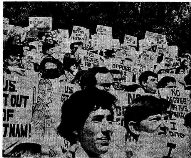
ANTIWAR DEMONSTRATION. Scene at Berkeley campus last spring when UN Ambassador Goldberg was greeted by opponents of Vietnam war.

On Nov. 9, Mario Savio was denied re-admission to the uni-