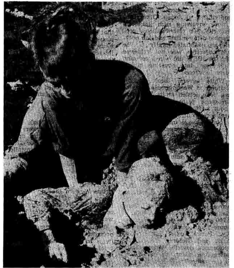
MILITARY TARGET? Rescuers dig out two children after U.S. bombs brought down their school at Thai-binh in North Vietnam on Oct. 21. Forty persons were reported killed, including 30 students from 13 to 16 years old, a woman teacher and two pregnant women. Six others, including four pupils, were wounded.

Four teams of "rural-development" workers, who are supposed