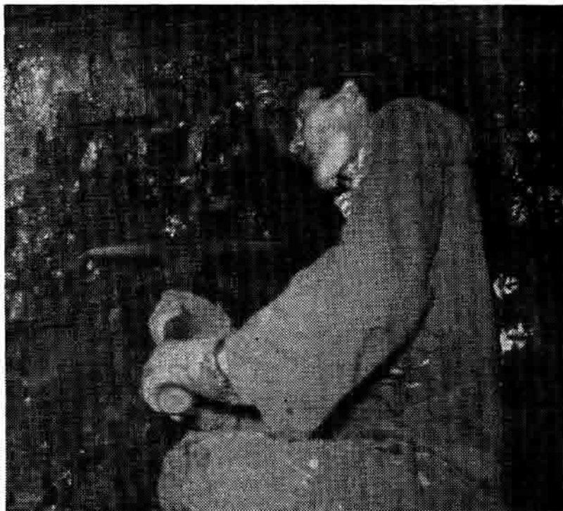
BACK-BREAKER. Worker crams into tiny digging area of Kentucky bootleg coal mine.

The strikers telegraphed Boyle a terse reply, "No comment." The six discharged strikers then asked Boyle to set up a special commission to investigate internal problems with the union locals. They were supported by a similar request from 1,200 miners from the U.S. Steel Corporation's Robena Mine in Waynesburg, Pa. who walked out on Sept. 17. The results of these negotiations between rank-and-file members, local lead-