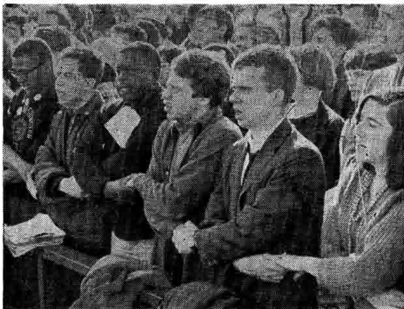
FOR PEACE AND BROTHERHOOD. Student demonstrators at April 17 March on Washington to End the War in Vietnam.

The steering committee, consisting primarily of representatives from campus and community antiwar committees, decided to shift the convention from Madison,