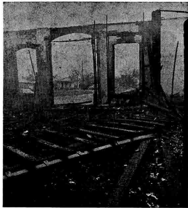
WHY DEACONS ARE NEEDED. This scene of remainder of SNCC Freedom School in Indianola, Miss., after it was fire-bombed by racists is a grim reminder of the need for organized self-defense by black communities.