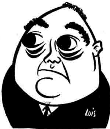
J. Edgar Hoover

The top political cop, J. Edgar Hoover, got into the act indirectly with an article in the June issue of the FBI law enforcement bulletin. He red-baited last spring's March on Washington by students protesting against the war in Vietnam, claiming that "Communists" were there from "all over the country." Crudely striving to incite a witch hunt against the student movement, he added that "Communists" are still busy "striving to start demonstrations." The government's smear cam-