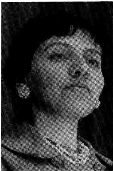
DIANE NASH BEVEL, who played a key role in the 1962 Freedom Rides, was among the women singled out for special tribute at the Washington March for their great contributions to the freedom struggle.

Marchers began forming at the Washington Monument before dawn and caused consternation in official quarters when they began marching to the Lincoln Memorial at 11:15 a.m. — 15 minutes ahead of schedule and before the march leaders had arrived.