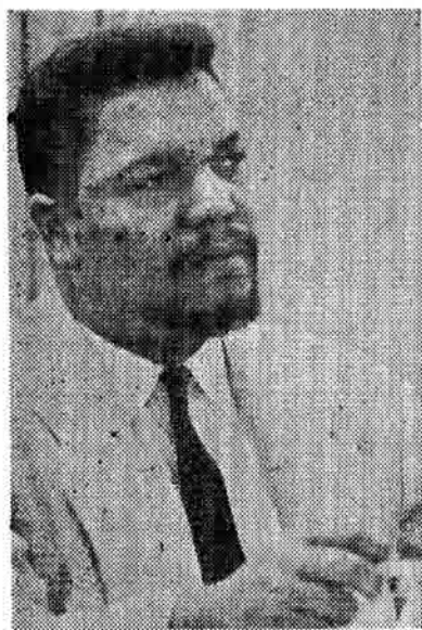
Robert F. Williams

"The fascist atrocities committed by the U.S. imperialists against the Negro have laid bare the true nature of the so-called democracy and revealed the inner link between the reactionary policies pursued by the U.S. government at home and its policies of aggression abroad."