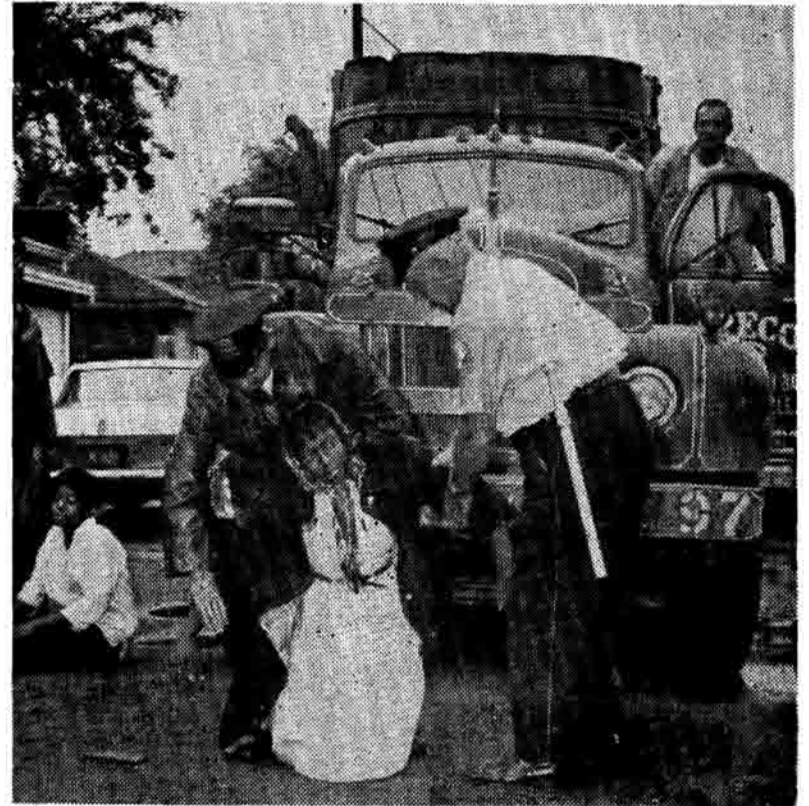
LIE-IN. Demonstrator is hauled off by Chicago cops.