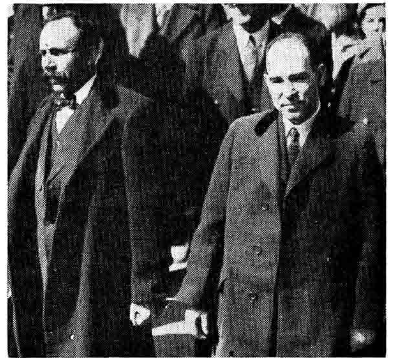
Bartolomeo Vanzetti (left) and Nicola Sacco during the long period of their imprisonment before martyrdom in Massachusetts' electric chair in 1927.

Indeed Salazar's frantic bellows about civilizing the Africans are merely a smoke-screen for plunder and reflects the excesses of a dying system.