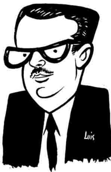
Dr. Osvaldo Dorticos

Referring to the anti-Cuba campaign that "fills the political stage of the U.S.," Dorticos said: "We know that this atmosphere of hysteria, this campaign . . . are part and parcel of pressures being exerted by the United States government — and on it too — to the end that once and for all there will be a decision to take armed aggression, direct armed aggression against my country. We know