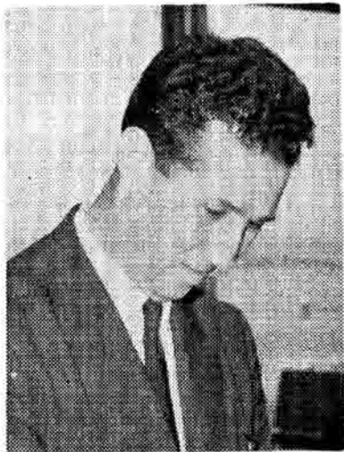
Mohammed Ben Bella

The program notes that "paradoxical as it may seem, the revolutionary sweep of the national struggle was perceived and felt