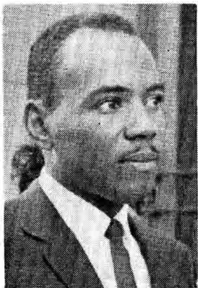
James H. Meredith