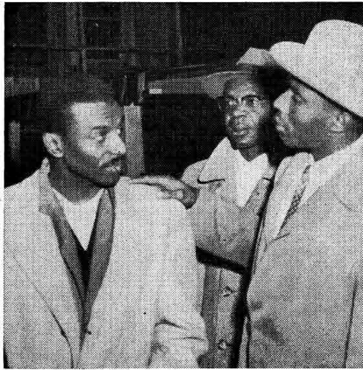
Rev. F. L. Shuttlesworth (left) of Birmingham, Ala. He helped organize Freedom Riders for Birmingham to Montgomery leg of trip. Show here with friends after racists bombed his home Christmas, 1956.

Birmingham Police Chief "Bull" (Continued on Page 2)