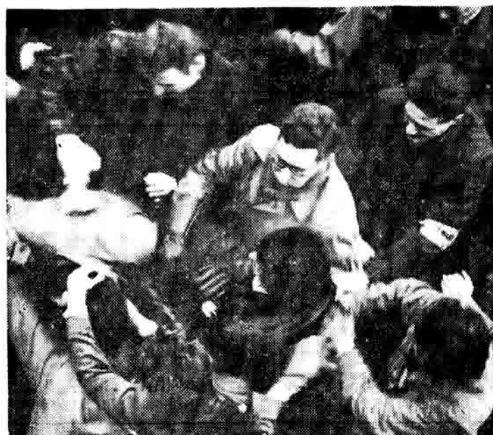
Incident during recent demonstration, when several hundred Britons marched on American air-force base near London. The demonstrators carried placards calling on the U.S. to abandon its British bases. The British population is alarmed over knowledge that American planes fly overhead with A-bombs.

massive students' meeting voted overwhelmingly in favor of unilateral renunciation of the bomb by Britain — and a special issue of the students' magazine Isis, wholly devoted to the horrors of nuclear warfare, set in motion a university referendum on this issue. (Two-thirds of the students entering the poll declared in favor of Britain stopping nuclear tests until there can be an opportunity to discuss disarmament with the Soviet Union. Results were announced on March 15, according to the New York Herald Tribune. — Ed.)