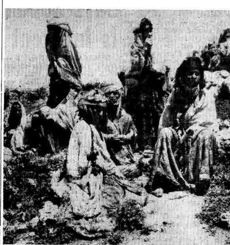
Women survivors of Melouza massacre. This village supported the MNA, the left wing of the Algerian nationalist movement. A guerrilla band invaded the village, took all the men — over 300 — prisoner and killed them. The MNA charges the crime to the right-wing FLN which is trying to crush the MNA by force.

their homes in Tunisia and Morocco, leaving a certain amount of economic space for a native commercial capitalist class and a stratum of intellectuals to develop.