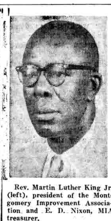
Rev. Martin Luther King Jr. (left), president of the Montgomery Improvement Association, and E. D. Nixon, MIA treasurer.