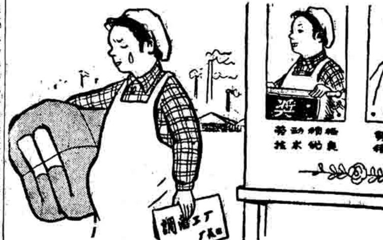
On July 7, 1956, the Peking People's Daily published this cartoon. The woman is carrying a discharge slip. In the poster she holds a production award. Discrimination against women is charged in some factories in An Shan.

here but also in other places." (P. D. Sept. 4.)