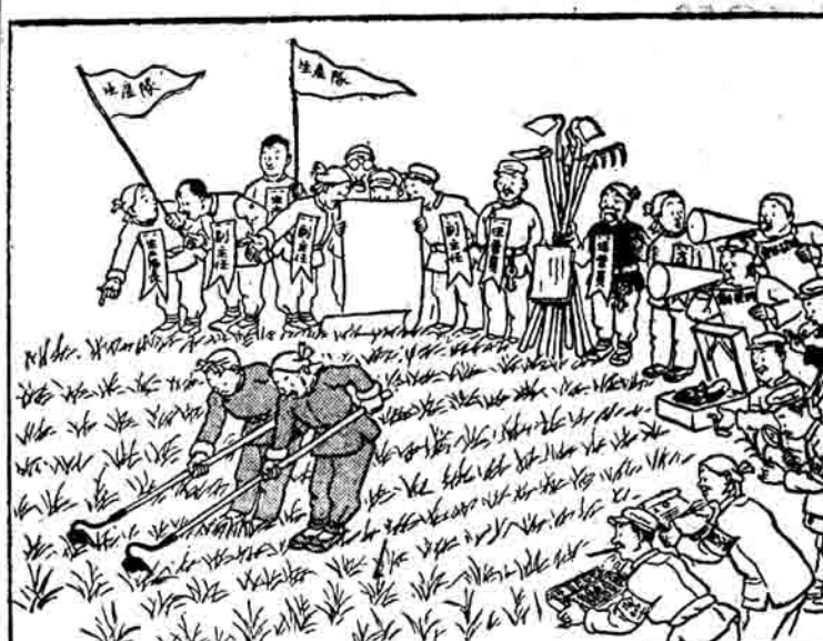
This cartoon appeared in May 1956 in the Peking People's Daily. An explanation says that there are too many non-productive persons in some agricultural Co-ops. This lowers both production and the income of Co-op members.