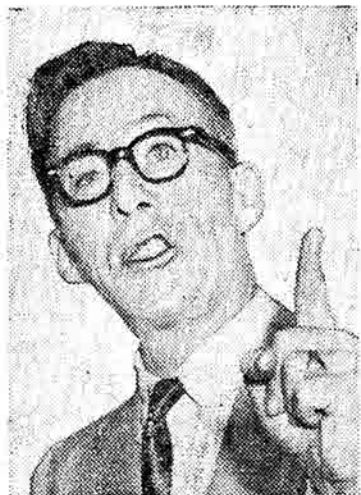
Harry P. Cain, former GOP senator and now a member of the Subversive Activities Control Board, recently defended the use of the Fifth Amendment, which grants immunity from self-incrimination.