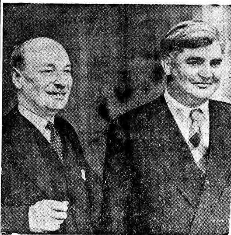
Clement Attlee (left), right wing leader of the British Labor Party, and Aneurin Bevan, left wing leader, are engaged in a bitter inner party struggle. They are shown above in friendlier mood during their China tour last summer.