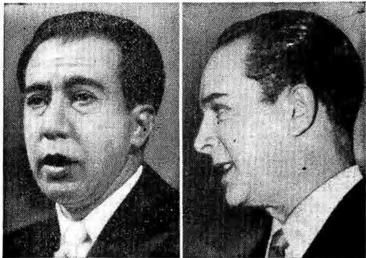
Former President Jacobo Arbenz Guzman of Guatemala (right) and his foreign minister Guillermo Toriello. Both looked to U.S. Ambassador Peurifoy instead of the workers and peasants to save their regime from Colonel Armas' rebellion. Peurifoy suggested they resign. They resigned and fled the country.