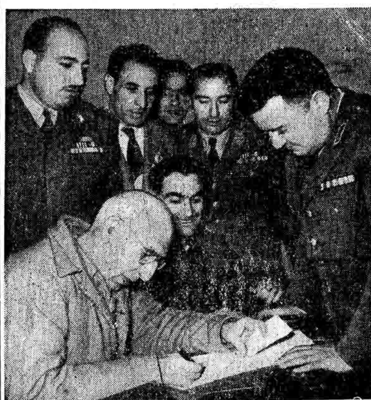
Dr. Mohammed Mossadegh (signing appeal document) is shown in Tehran after he was sentenced to three years in prison for alleged "treason." His government was overthrown by a violent royalist coup d'etat backed by British and U.S. imperialism trying to snatch back oil resources nationalized by the Mossadegh regime.