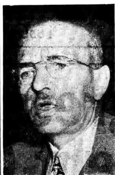
HARRY DEXTER WHITE

At the end of 1945, when White was an assistant secretary of the Treasury, another ex-Stalinist, Elizabeth Bentley, went to the