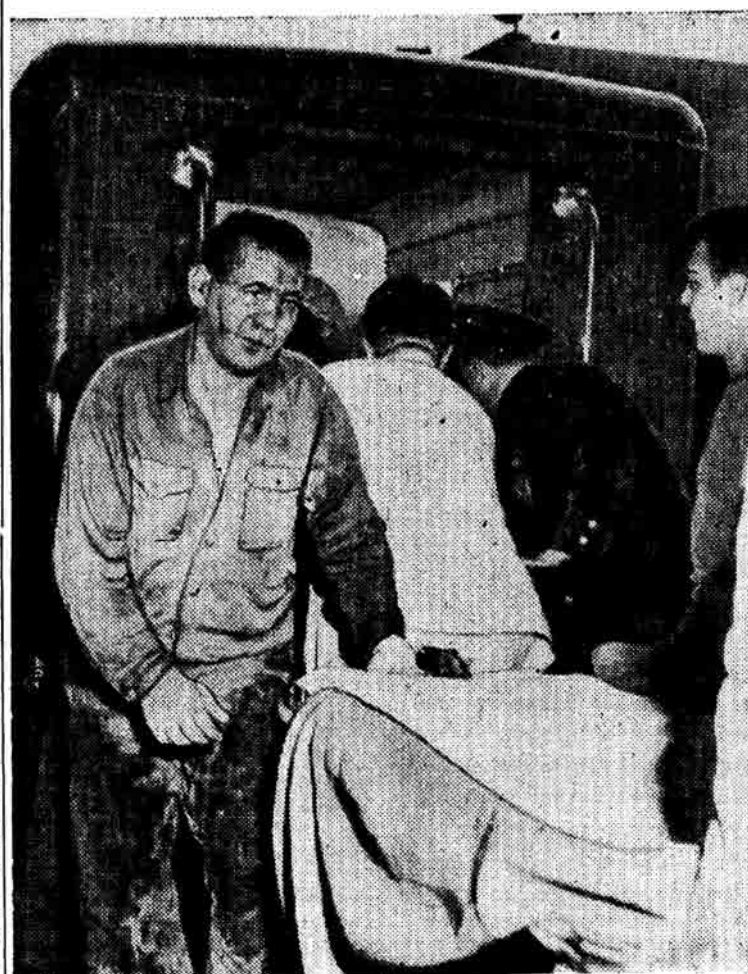
A dazed longshoreman awaits first aid beside an ambulance in Boston after a series of chemical explosions on the Norwegian freighter Black Falcon killed seven men. Most of the dead fell back into the flaming hold as they tried to climb to safety. The International Longshoremen's Ass'n charged safety violations were responsible for the blast.