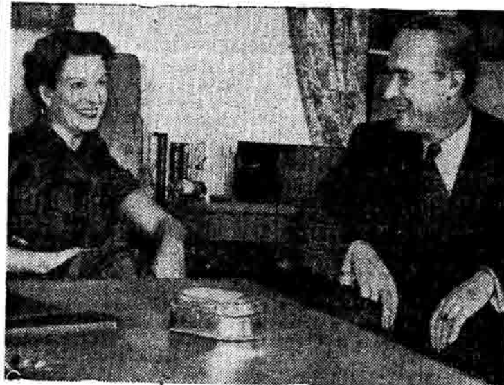
Alfred Krupp, whose armaments empire armed Hitler, and his wife, who lived fifteen years in the U.S. and acquired American citizenship. After serving six years of a 12-year sentence as a war criminal, Krupp was released, his vast industries restored to him.

The name of Krupp is again coming to the fore in Germany. In 1947, Alfred Krupp, head of the family that dominated German war industries through the world wars