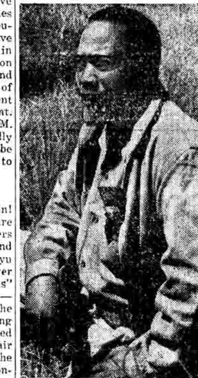
JOMO KENYATTA, leading Kenya nationalist figure, has been framed up and sentenced by the British rulers to seven years imprisonment at hard labor, on the false charge he organized and inspired the Mau Mau movement among Kikuyu tribesmen who are in revolt to win their international liberation.

Those who want a revolution made in accordance with rules framed at Transport House will want in vain. The Kikuyu have no