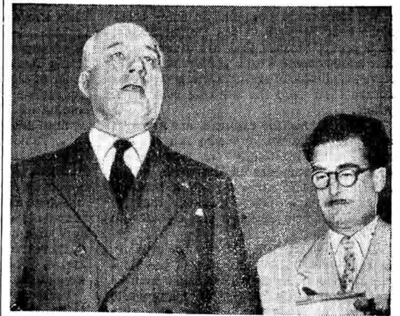
Rene Mayer (l.) shortly after he quit as French premier in internal crisis is shown talking to a reporter. Mayer's government fell the same day Eisenhower announced plans for a secret Big Three meeting in Bermuda. The unstable French capitalist government has had 17 changes of regime since the end of World War II.

The report implies that it strongly favors federal censorship. It urges an "effort by Congress" against publishers and favors new laws which will limit "the liberal conception of the tradition founded upon the constitutional provision guaranteeing the freedom of the press."