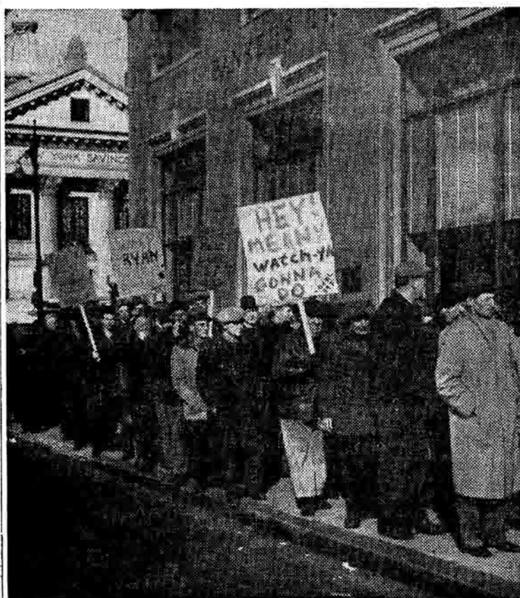
Rank-and-file dockworkers picket Int'l Longshoremen's Ass'n (AFL) headquarters in New York to demand resignation of Joseph P. Ryan, lifetime president of the union. Demonstration came after Ryan's appearance before New York State Crime Commission, where large-scale corruption and siphoning off of union funds for personal use were revealed.

and the Bronx, has been the battleground of two main opposing groups: The Rank-and-File Group, under the influence of the Stalinists, and the Progressive Group, now heading the administration.