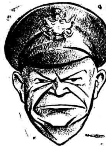
Gen. Eisenhower, assigned by Truman to speed up construction of NATO, now finds it in a state of crisis. He is pressuring his allies to resume the break-neck pace he originally set down.

On the other hand, numerous German generals and bourgeois nationalists favor a German Army under its own autonomous high command that would not be completely integrated into a European Army. These elements obviously want to revive the traditions of the Wehrmacht. West German President Heuss, however, is uneasy about the entire rearmament plan and, wishing to delay ratification of the American-inspired "Peace Contract" and "European Defense Community" by the Bonn parliament, appealed to the German Constitutional (Supreme) Court in 1952, asking it to determine whether or not adherence to that military system is contrary to the new German constitution.